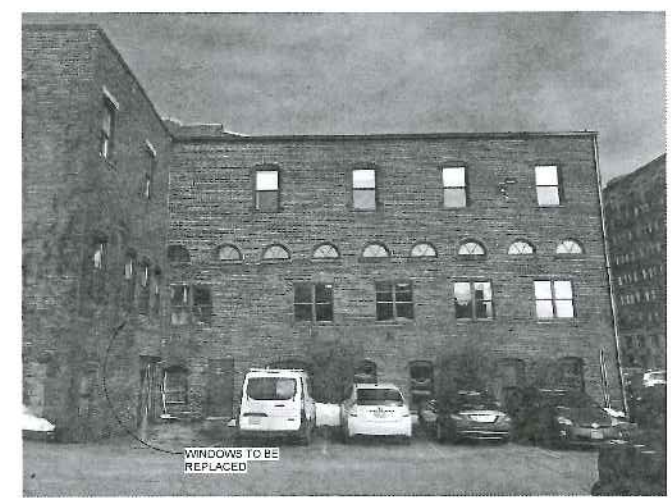
WEST ELEVATION - FROM PARKING LOT