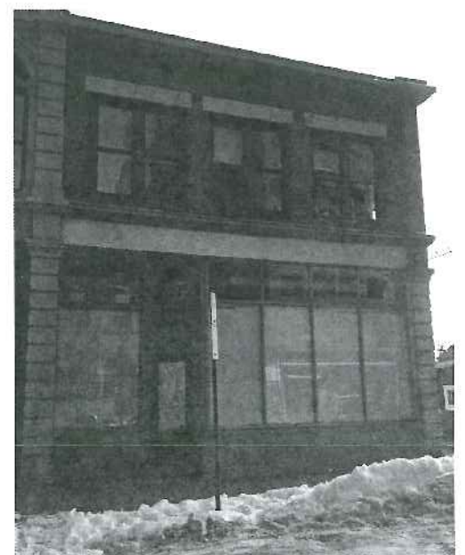
NORTH ELEVATION - FROM FREE STREET