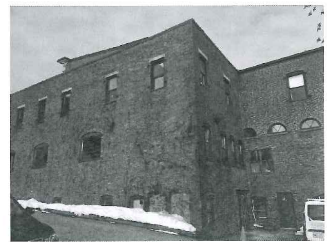
WEST & SOUTH ELEVATION - FROM PARKING LOT