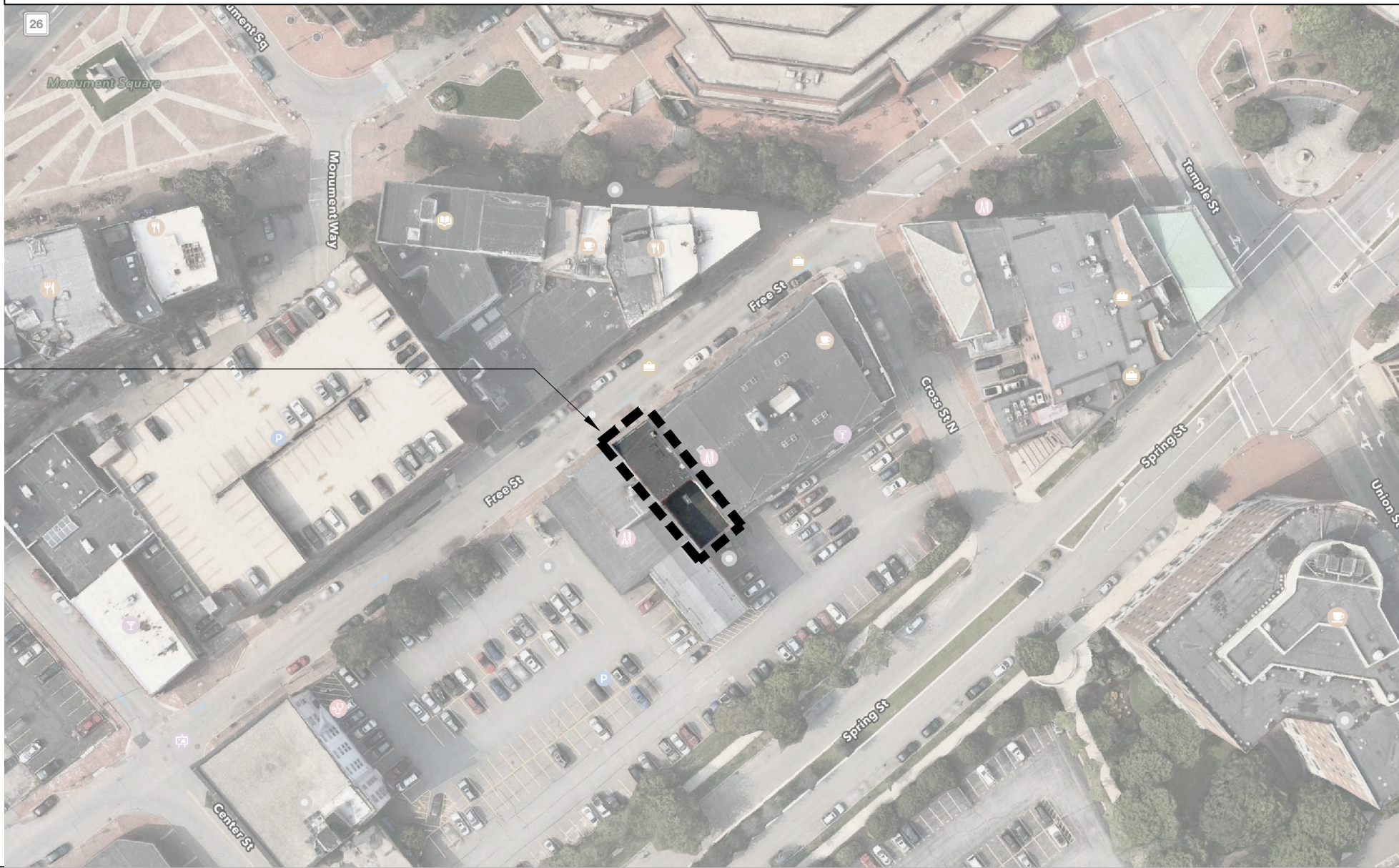
22 FREE STREET PORTLAND, MAINE 04101