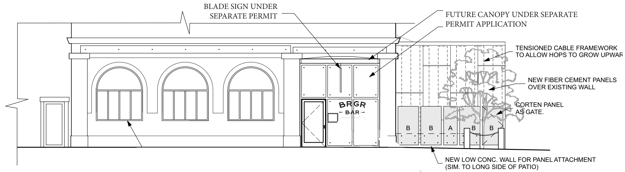
① BROWN ST. ELEVATION SCALE: 1/8" = 1'-0" 0 4' 8' 16'