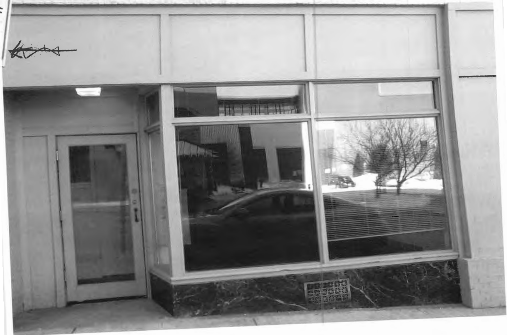
Building Frontage 19 feet