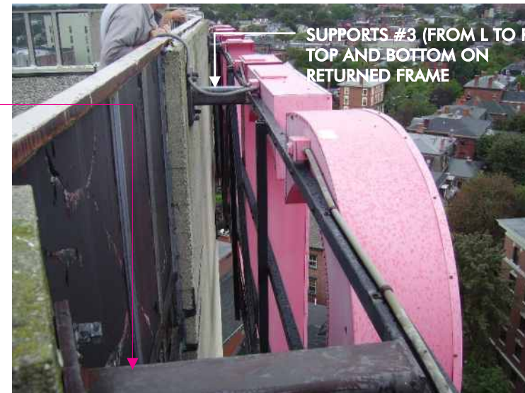
SUPPORTS #3 (FROM L TO R) TOP AND BOTTOM ON RETURNED FRAME