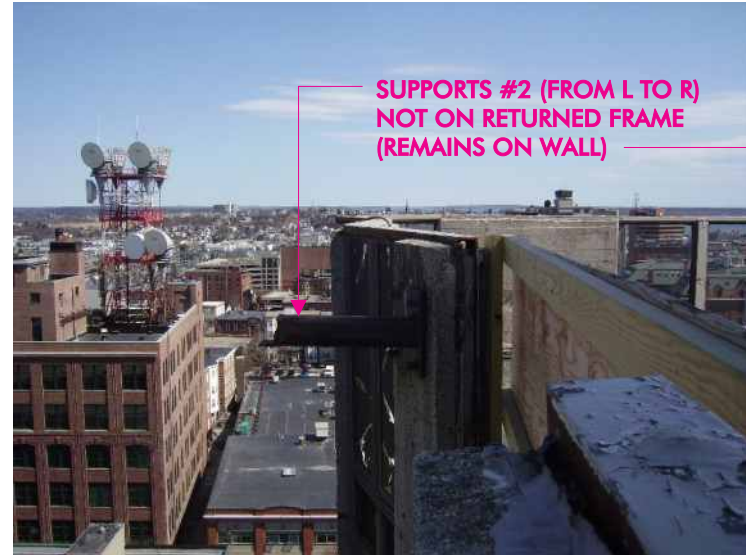
SUPPORTS #2 (FROM L TO R) NOT ON RETURNED FRAME (REMAINS ON WALL)