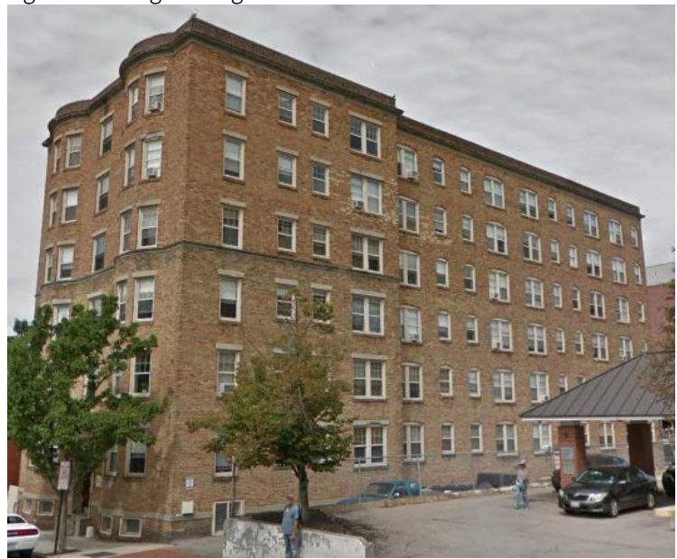
Figure 2: Existing Building

The property is located in the B-3 Downtown Business zone and within the Congress Street Historic Overlay district. The B-3 zone allows residential dwelling units with no residential density requirements and the project is exempt from parking requirements under the change of use provisions for an historic structure. Therefore, the applicant does not need to provide any additional dedicated parking for the project under the zoning ordinance as a change of use in the B3 Downtown Business Zone or in the Historic District. The site will provide compact in-city living for renters, which is near services, such as businesses, institutions, employers and public transportation