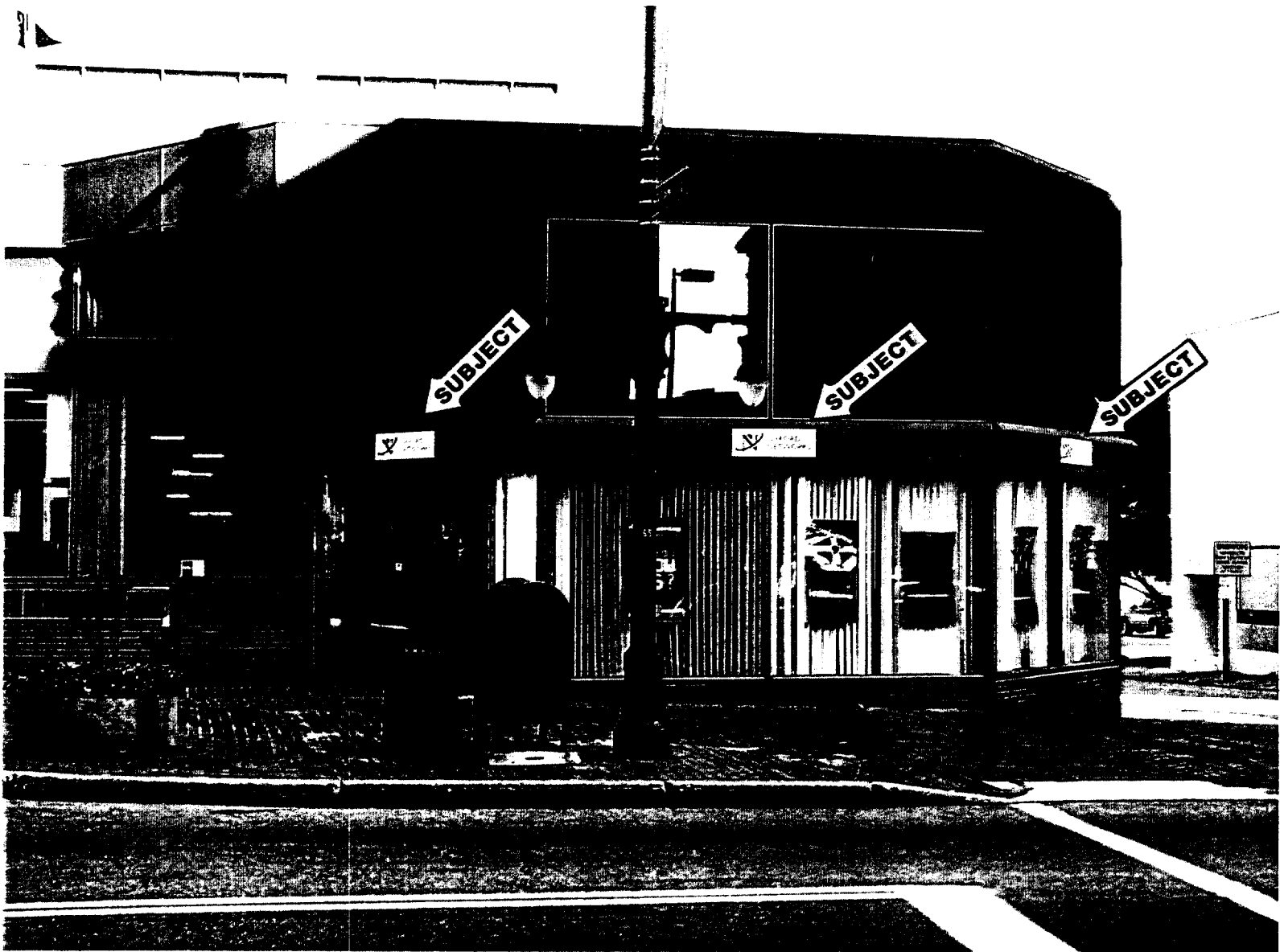
All 3 Signs are 1' x 3'