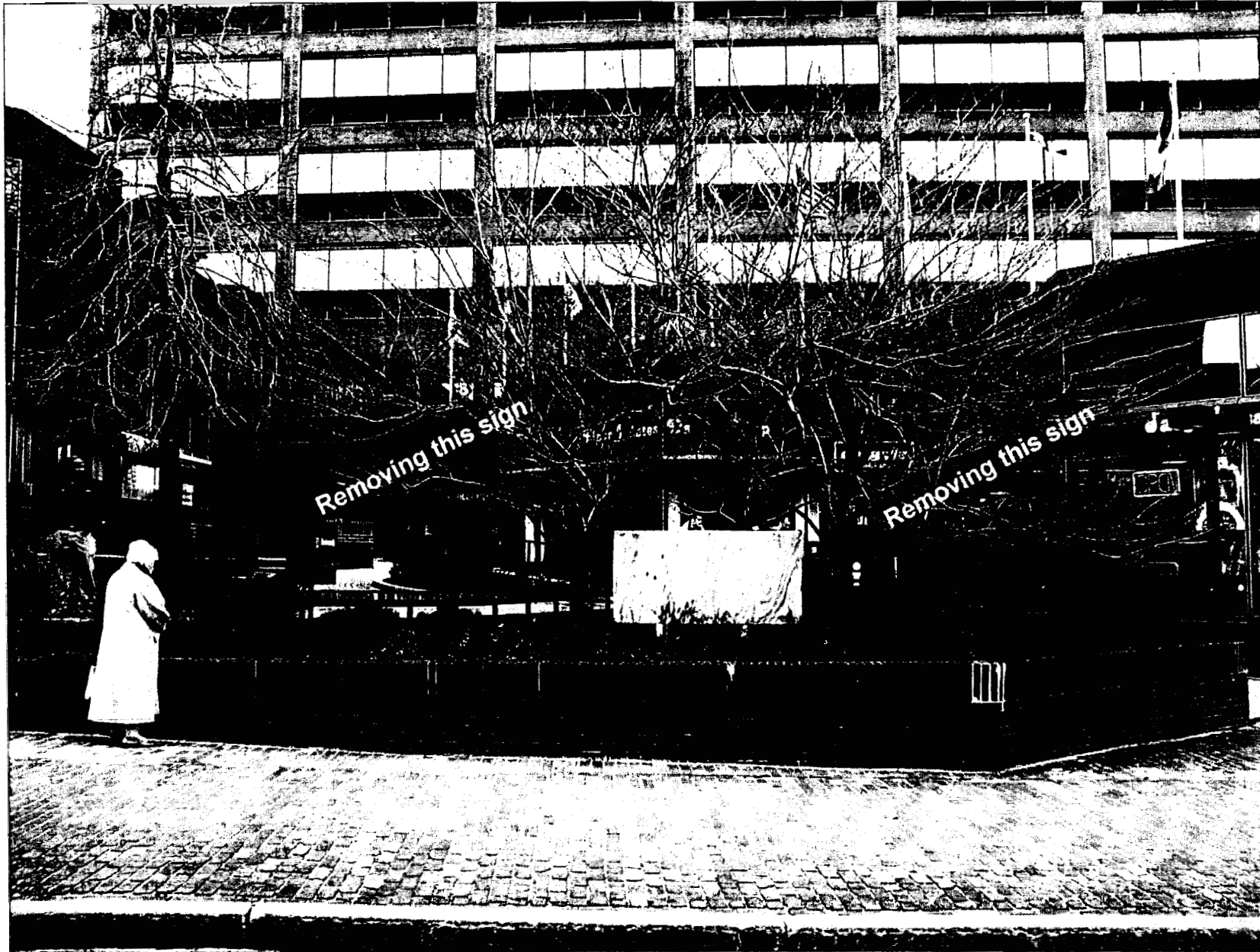
3' high x 6' long x 12" thick Granite Sign