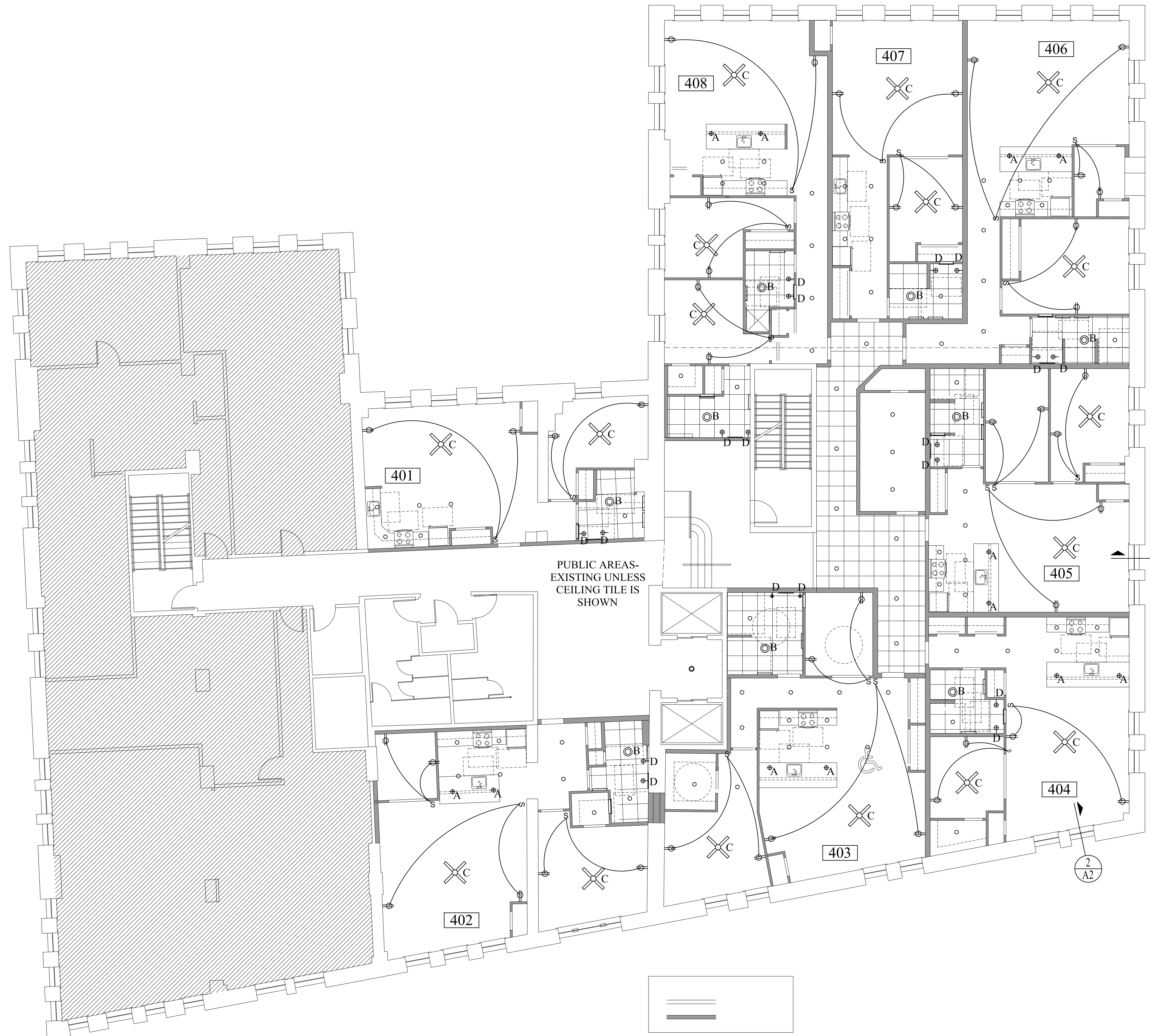
1 REFLECTED CEILING PLAN SCALE: 1/8" = 1'-0"