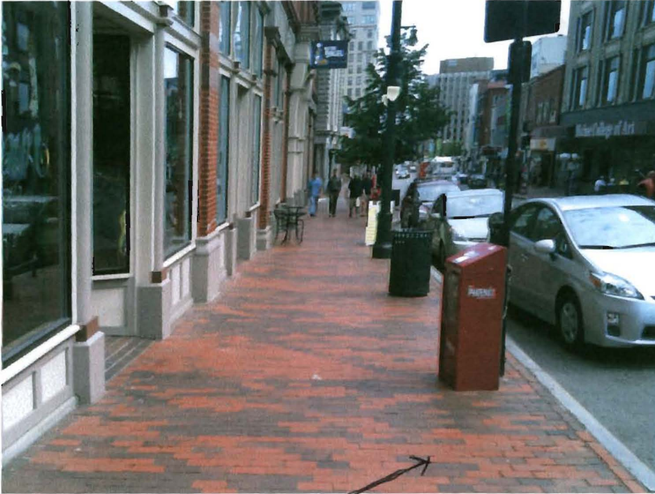
Sign will be located here: The Sidewalk is about 12' wide.