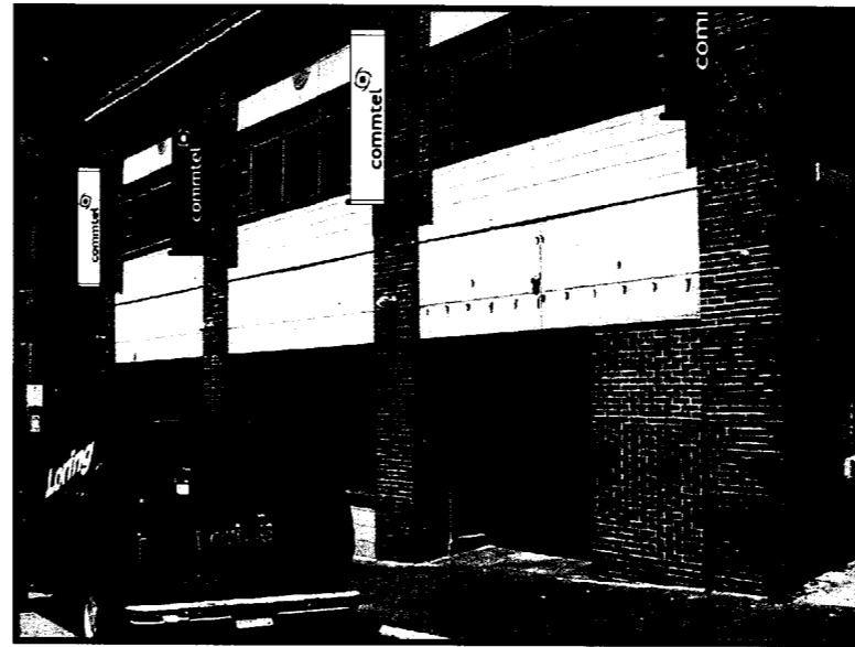
FRONT ELEVATION - TOTAL 4 BANNERS