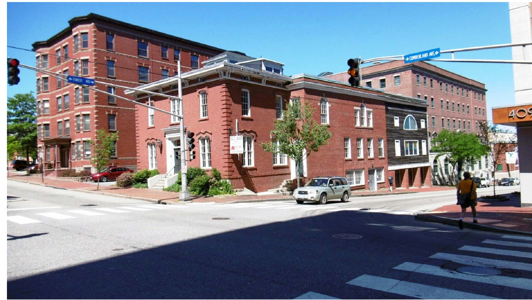
CORNER OF CUMBERLAND & FOREST AVE.'S SCALE: N.T.S