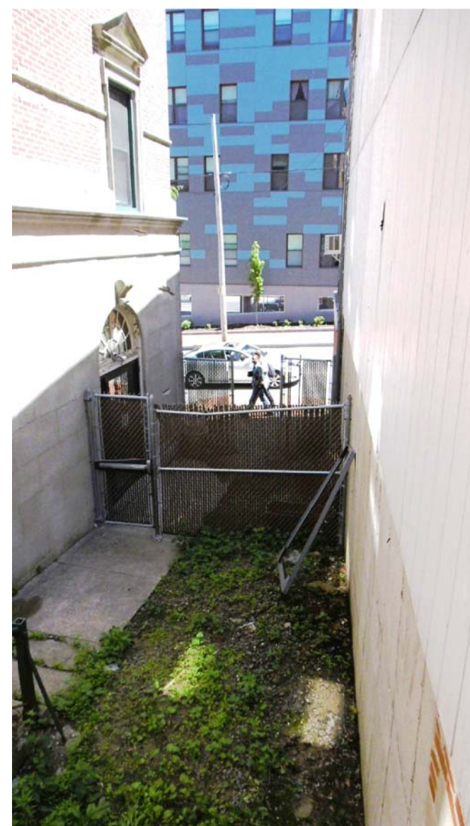
ALLEY @ YMCA SCALE: N.T.S