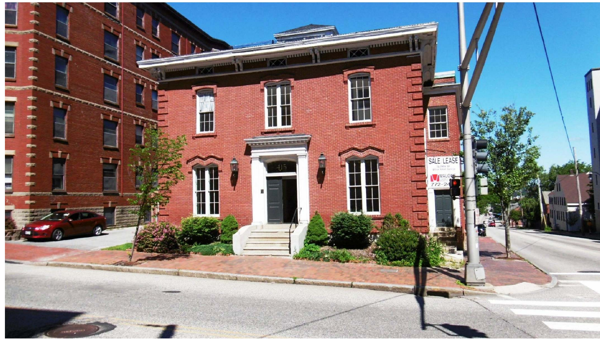
CUMBERLAND AVE. ELEVATION SCALE: N.T.S