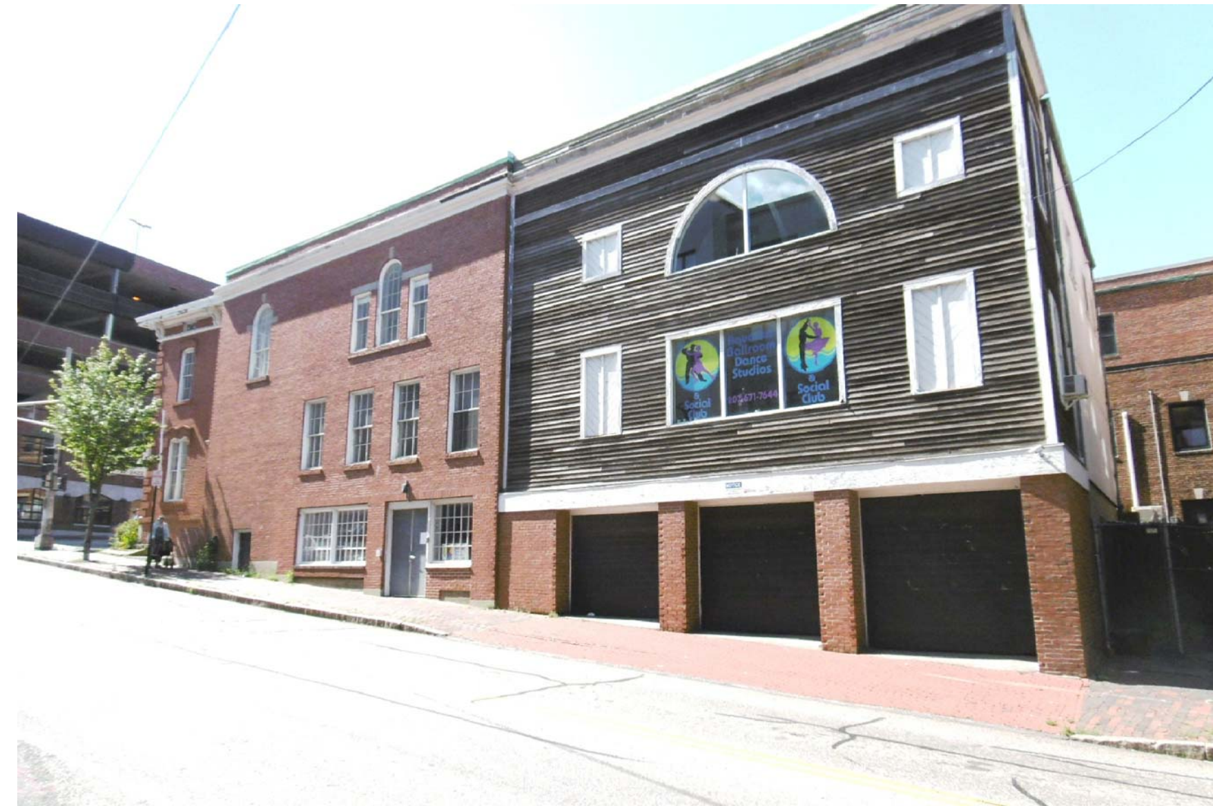
FOREST AVE. ELEVATION SCALE: 1/4" = 1'-0"