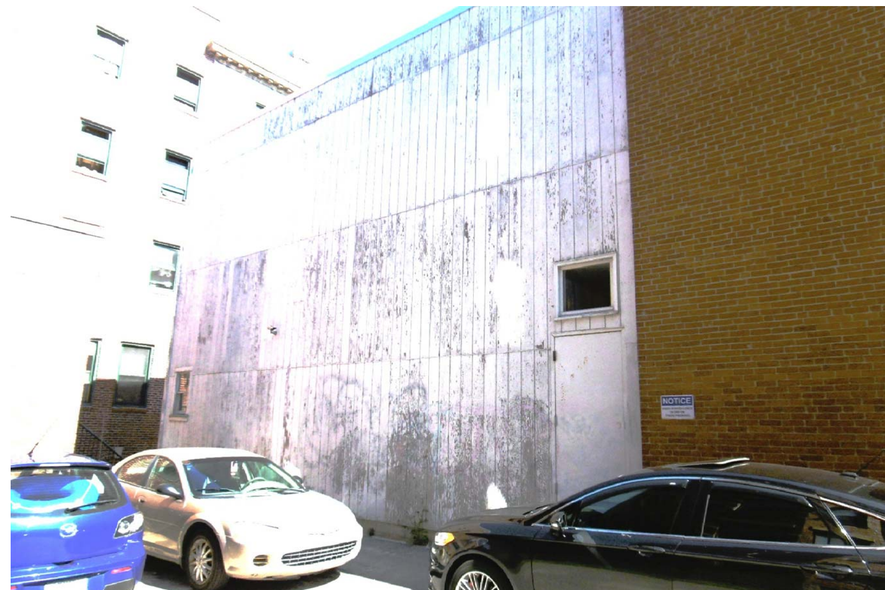
DRIVEWAY SIDE ELEVATION SCALE: N.T.S