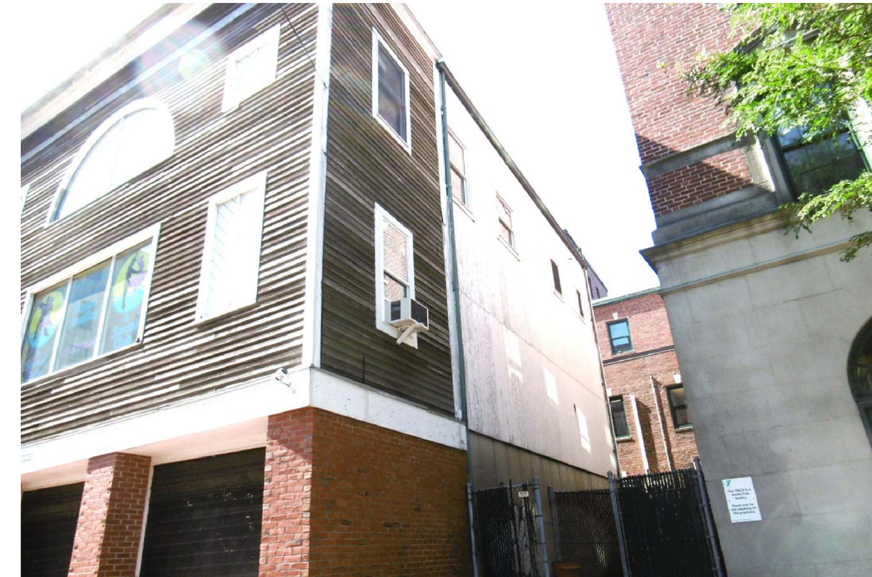
FOREST AVE. ELEVATION SCALE: N.T.S