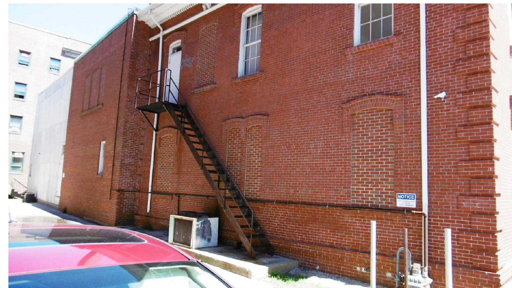
DRIVEWAY SIDE ELEVATION SCALE: N.T.S