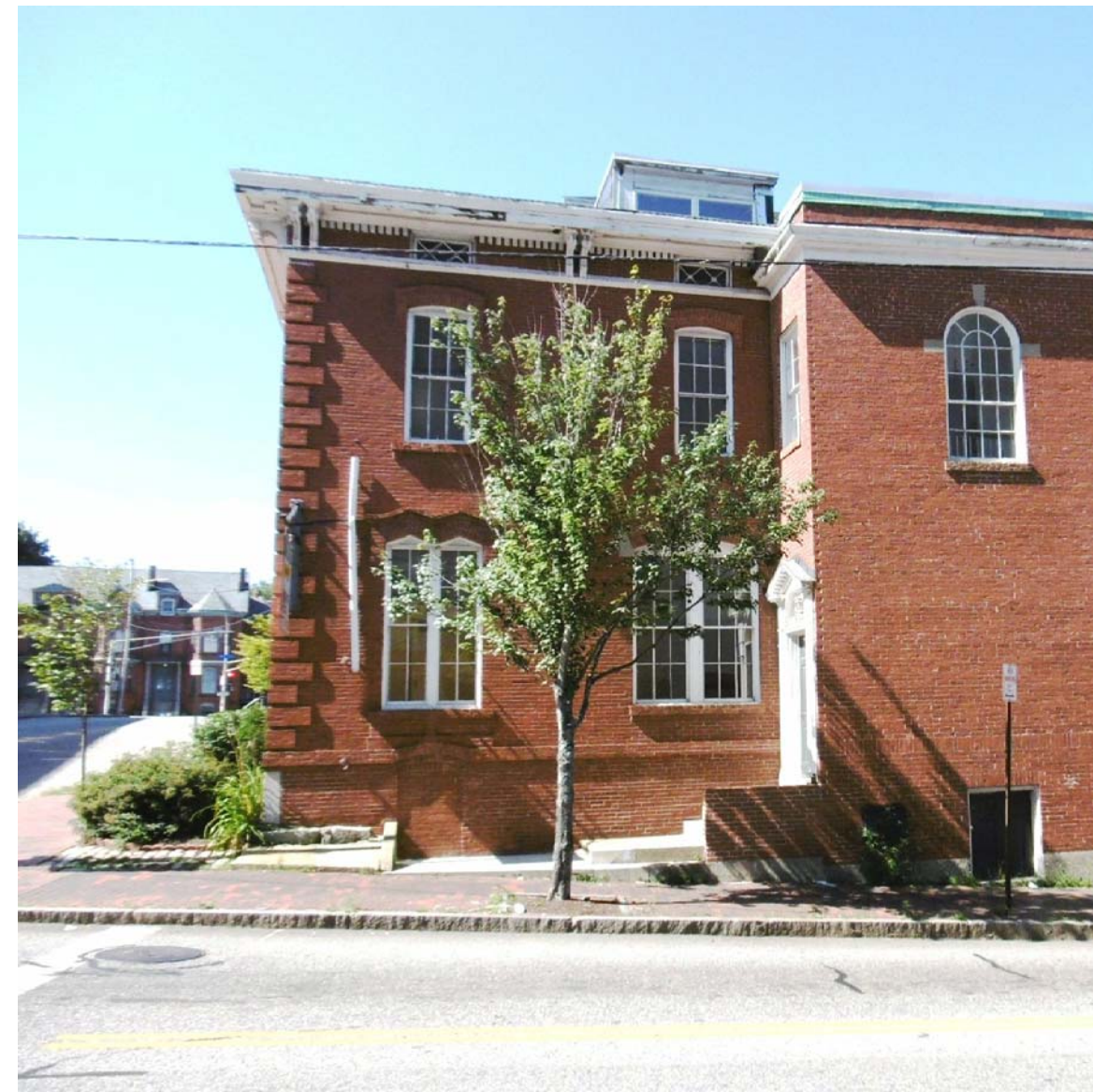
FOREST AVE. ELEVATION SCALE: N.T.S