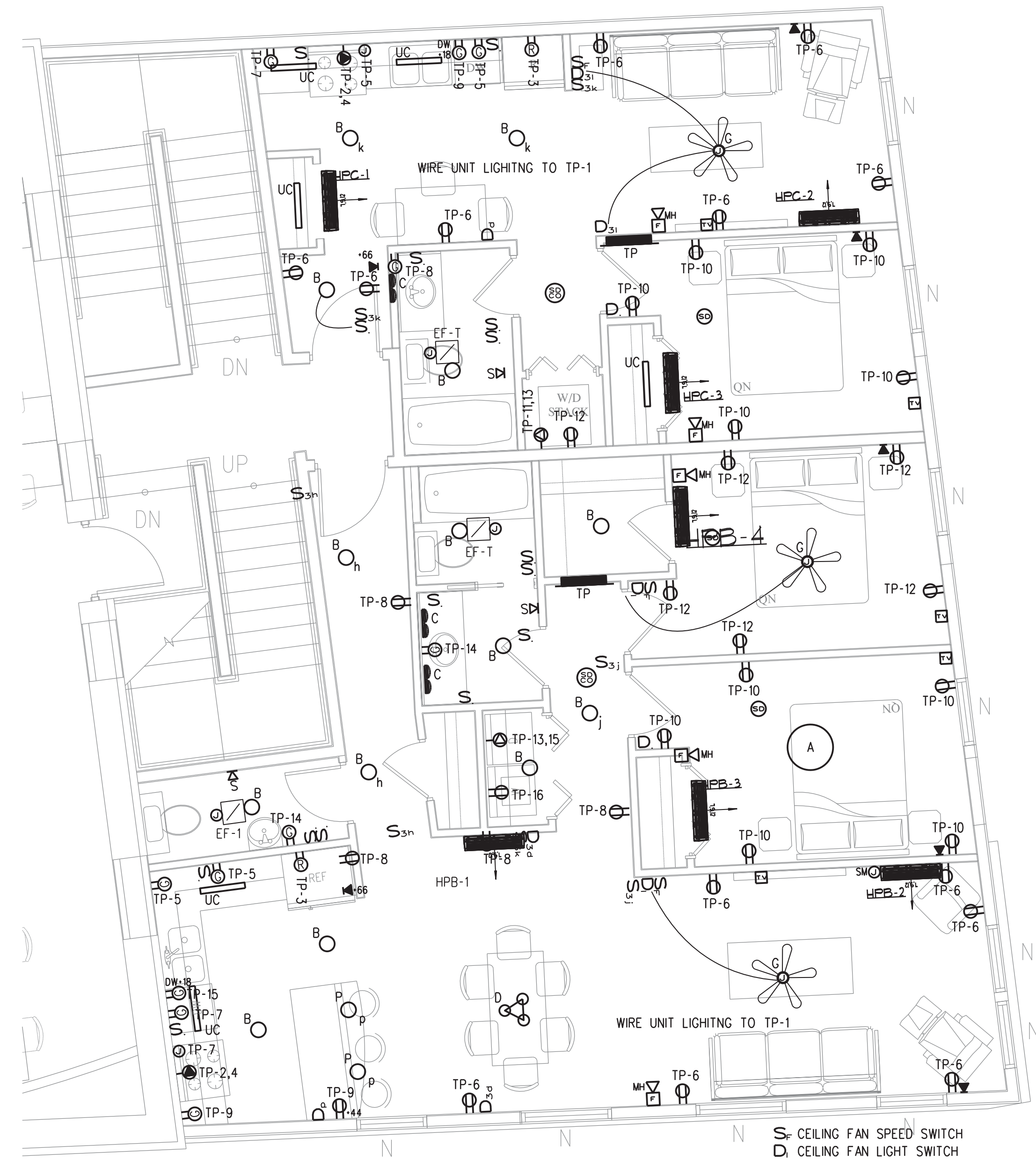
UNITS C/D PARTIAL PLANS-SECOND FLOOR SCALE: 1/4"=1'-0"