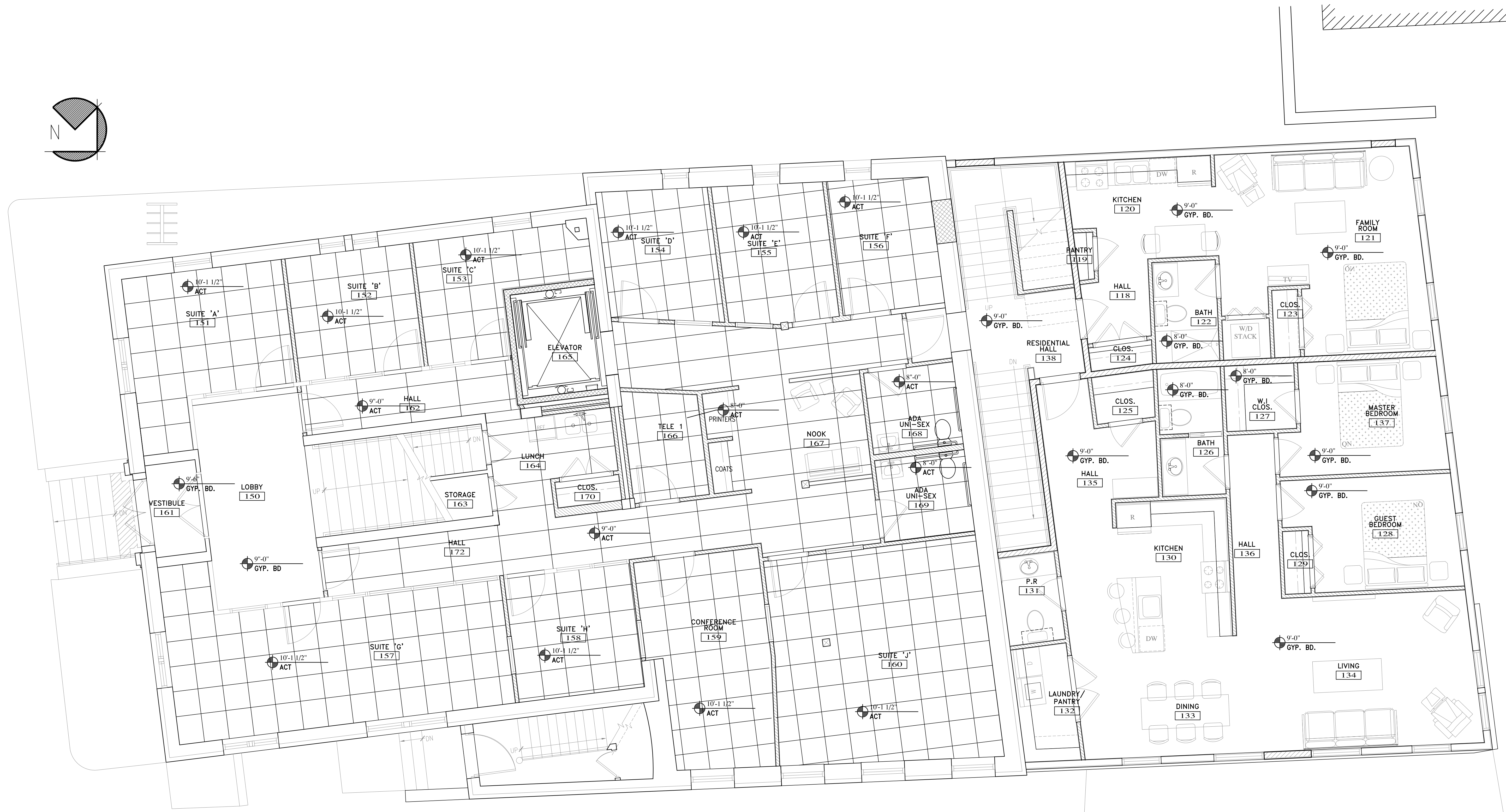
FIRST FLOOR REFLECTED CEILING PLAN SCALE: 1/4" = 1'-0"

GENERAL NOTE: FOR ALL LIGHTING LOCATIONS AND TYPES PLEASE REFERENCE ALL E-SERIES DRAWINGS