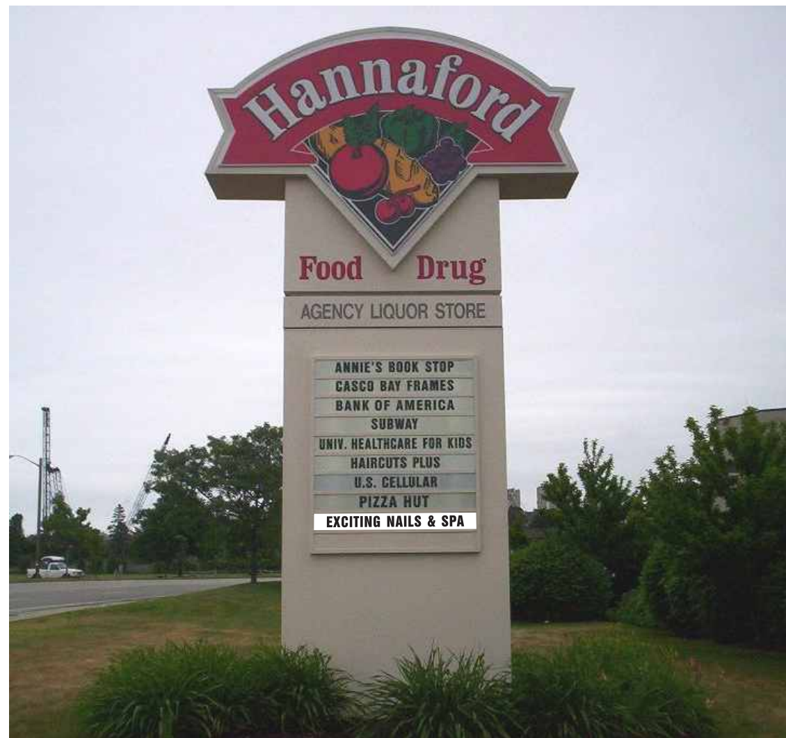
PHOTO COMPOSITE NOT TO SCALE