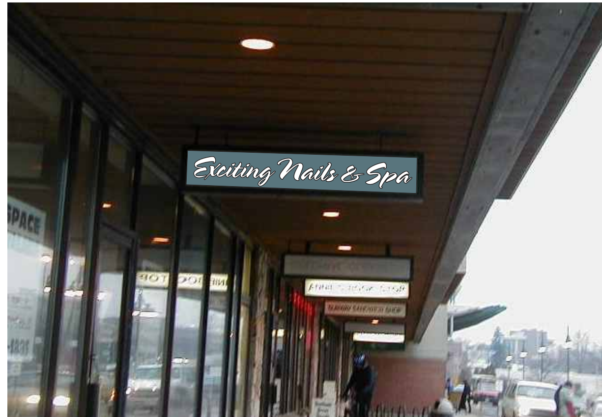
PHOTO COMPOSITE NOT TO SCALE

NEW FACES FOR EXISTING UNDER CANOPY SIGN SCALE: 1 1/2" = 1'-0" (2) FACES REQUIRED