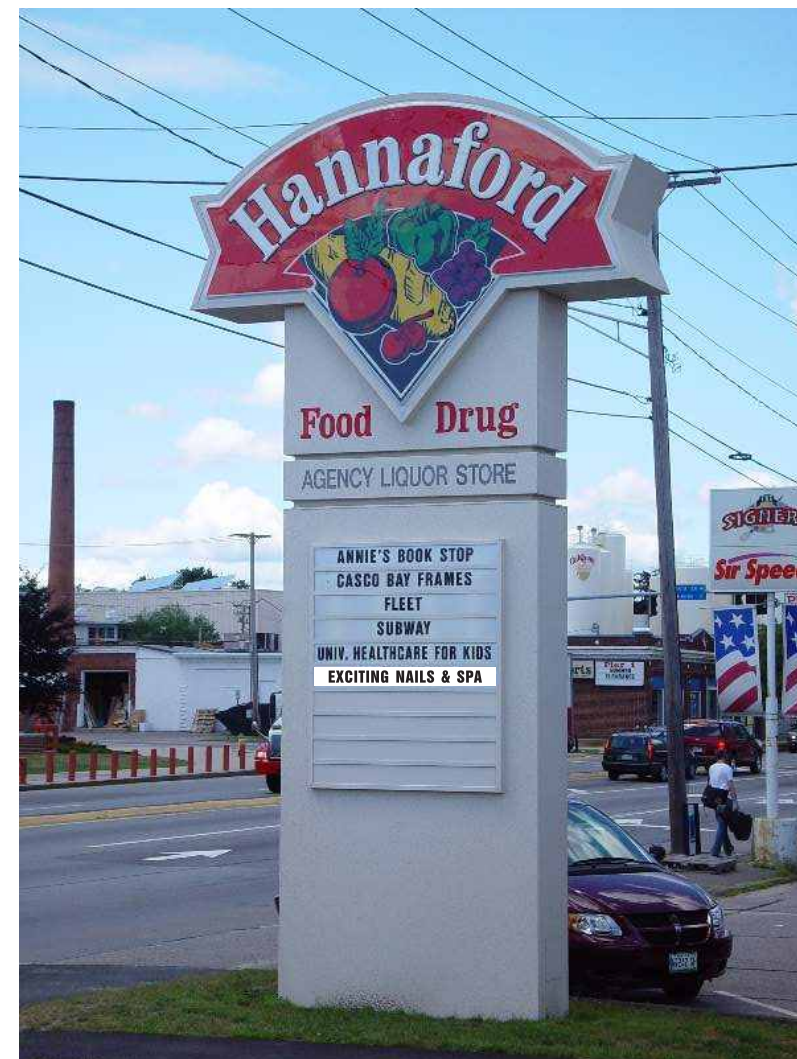
PHOTO COMPOSITE NOT TO SCALE