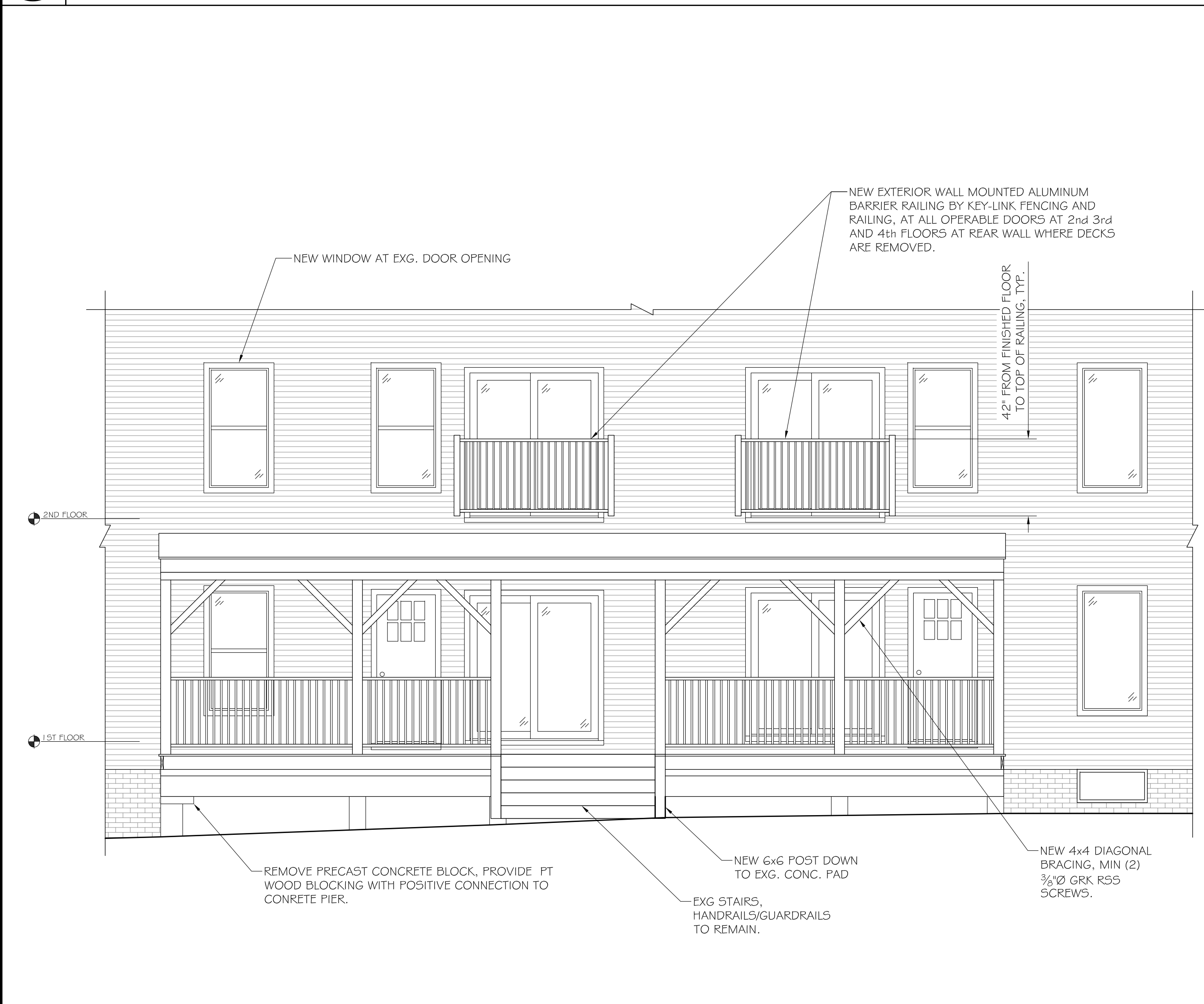
A3 PARTIAL REAR ELEVATION - PROPOSED SCALE: 1/4" = 1'-0"