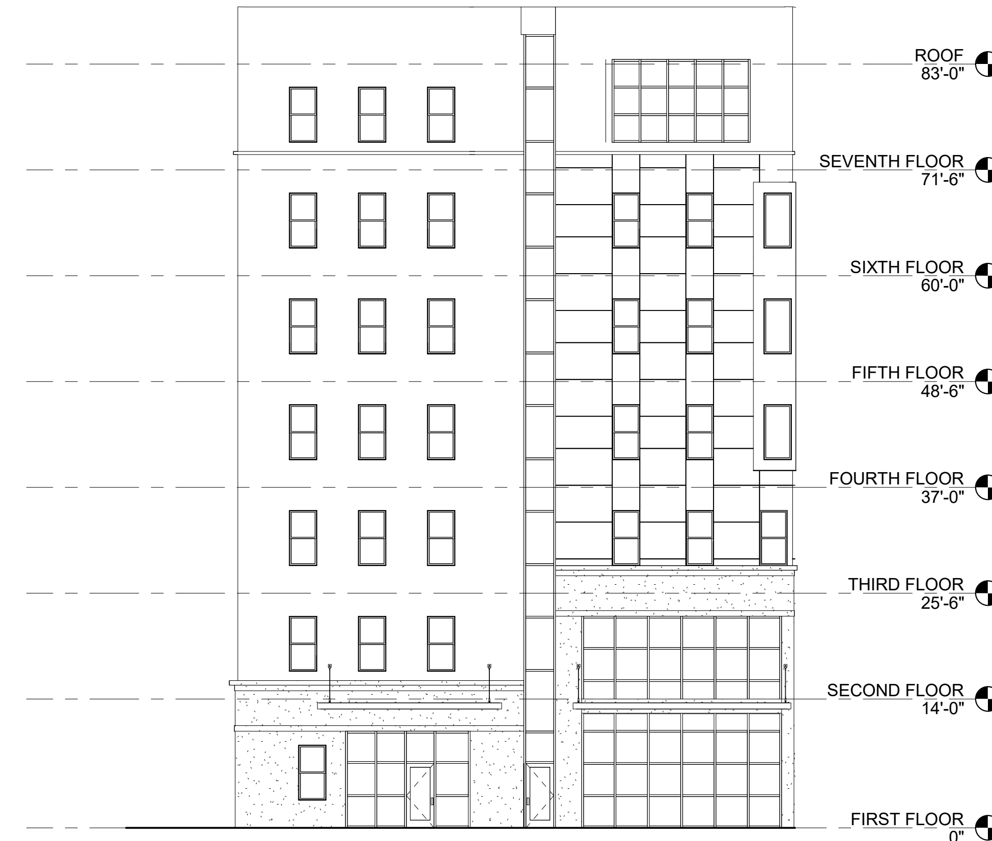
4 | EAST ELEVATION 3/32" = 1'-0"