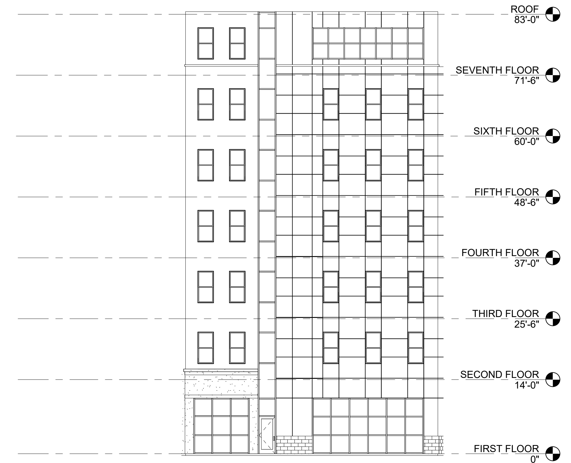
3 | WEST ELEVATION 3/32" = 1'-0"