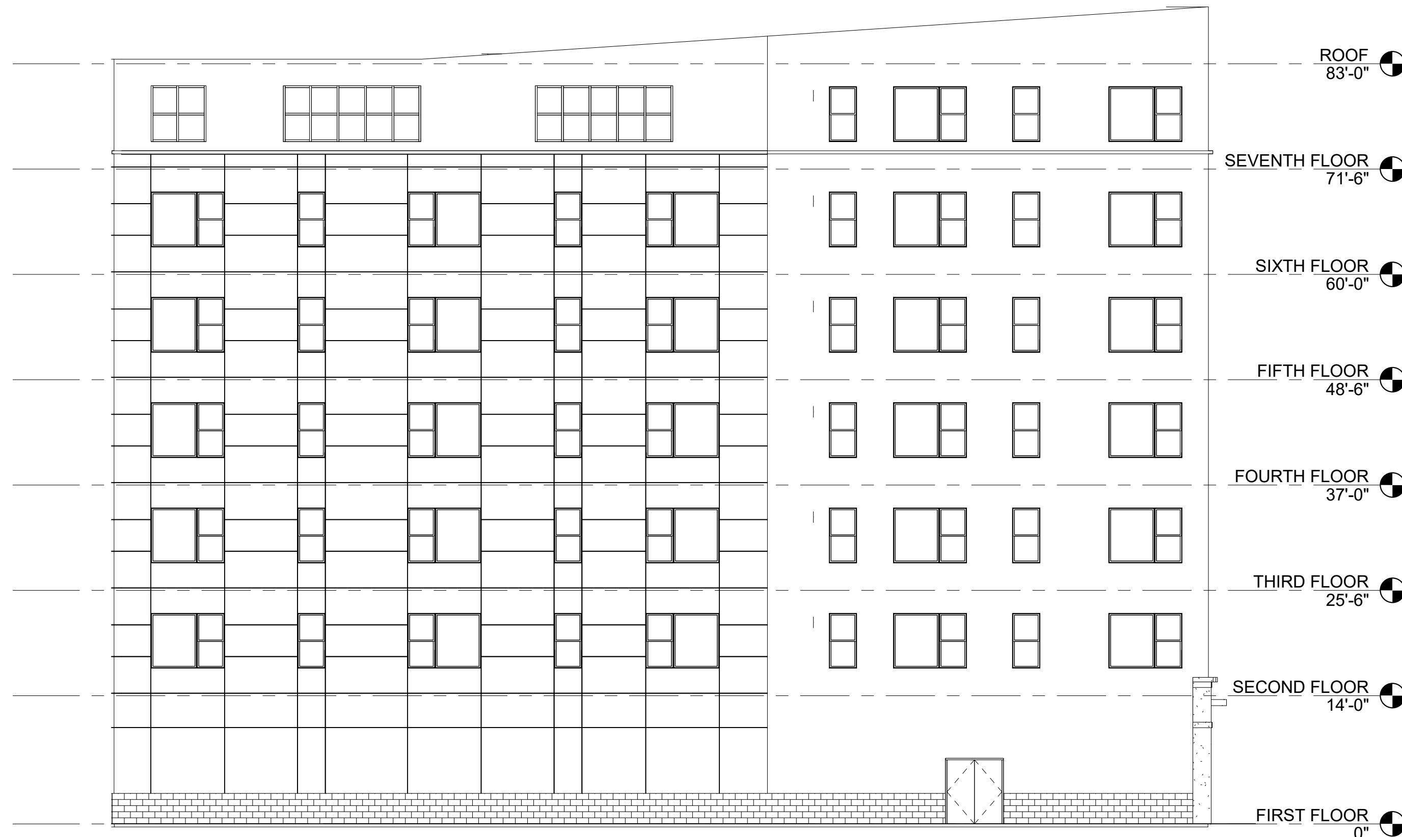
1 | NORTH ELEVATION 3/32" = 1'-0"