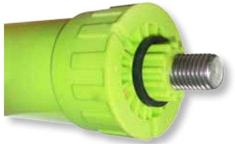
Clear shield & rubber gasket for a clean installation