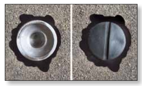
The anchor cup securely installed shown with and without plug cap