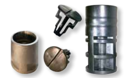
Choose either the 2 or 4-inch anchor cups. Pop-in, screw-out plug fits both anchor cups