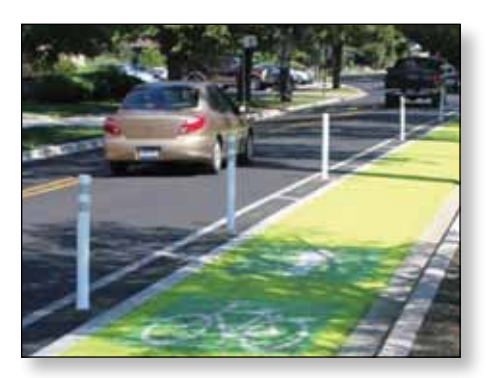
Bike lane and pedestrian walkway delineation