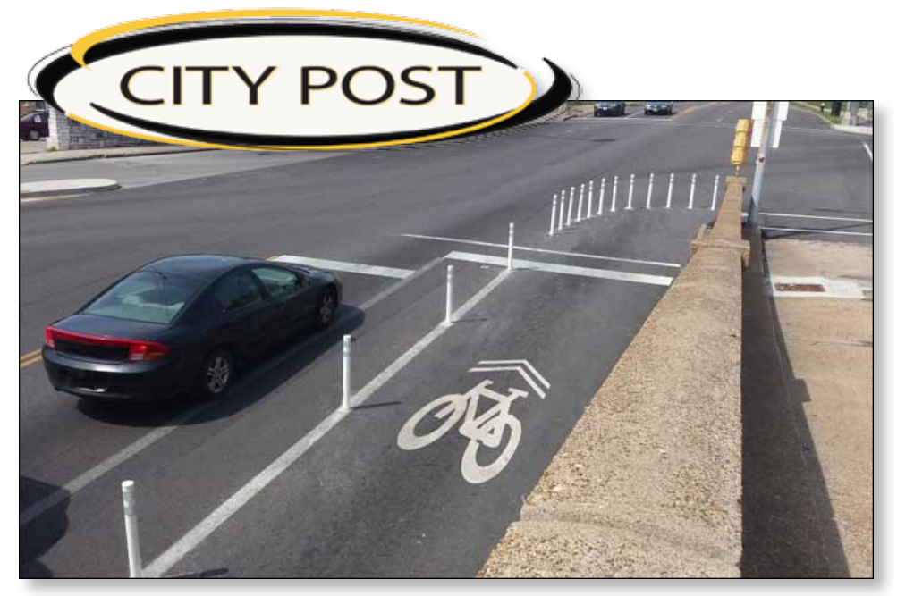
Slender, tough City Posts are the ideal product for protected bike lanes and cycle tracks