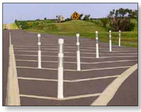
Making gore points more visible