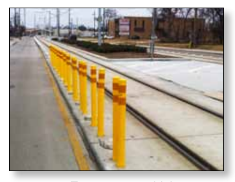
Emergency vehicle access