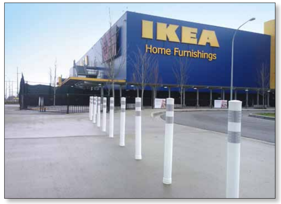
City Posts provide protection and guidance in high vehicle and foot traffic environments