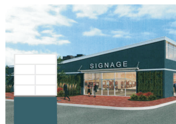
PROPOSED / INSTALLED DEPICTION NO SCALE

POLE COVER PAINTED BLUE-GRAY TO MATCH BUILDING (TBD), ALUM. TENANT CABINET PAINTED SILVER METTALIC 1033SP, WHITE TENANT FACES (TENANT GRAPHICS TBD), PIPE SET IN CONCRETE, ELECTRICAL TO SIGN LOCATION BY CUSTOMER