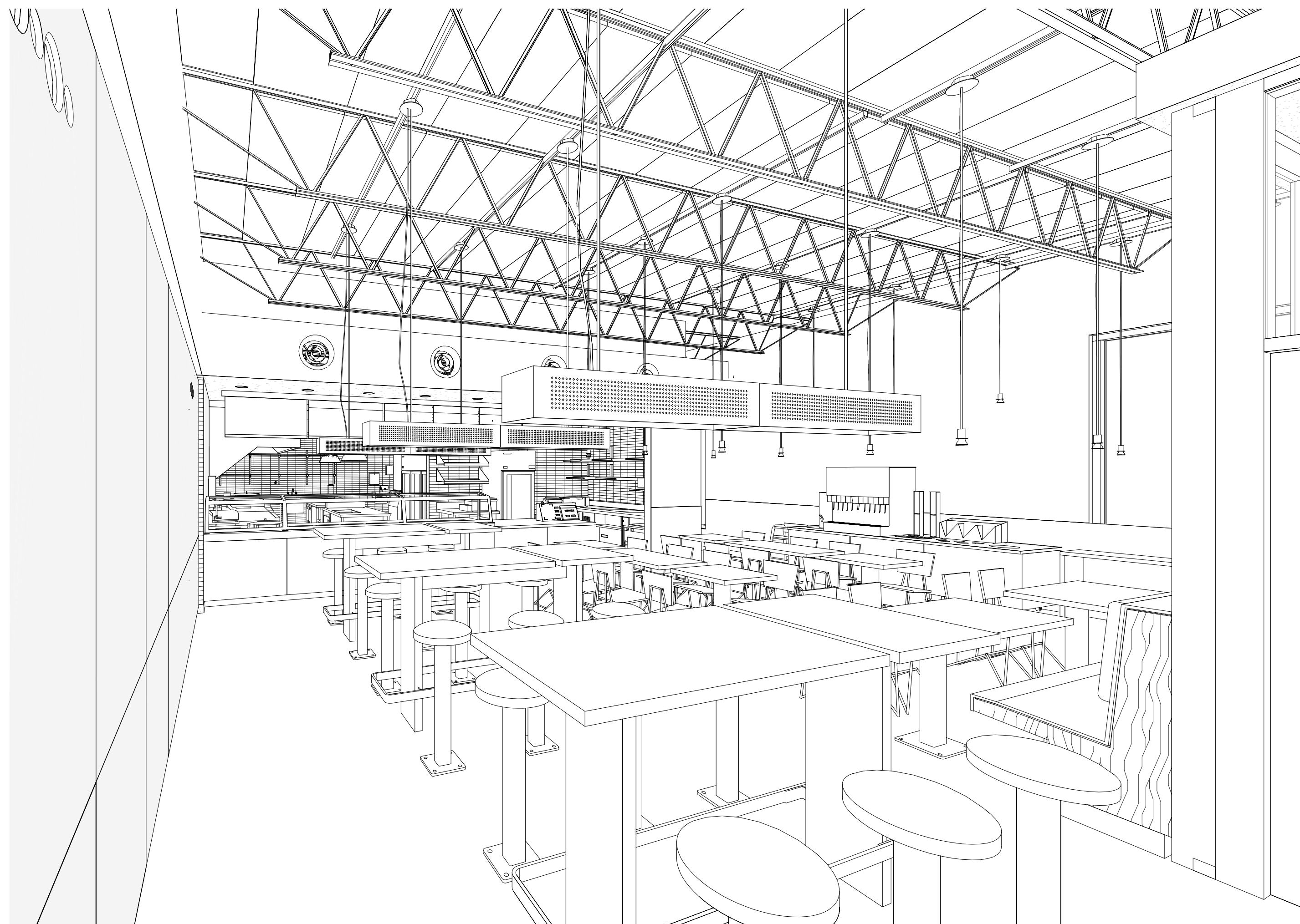
4 A400 PERSPECTIVE VIEW