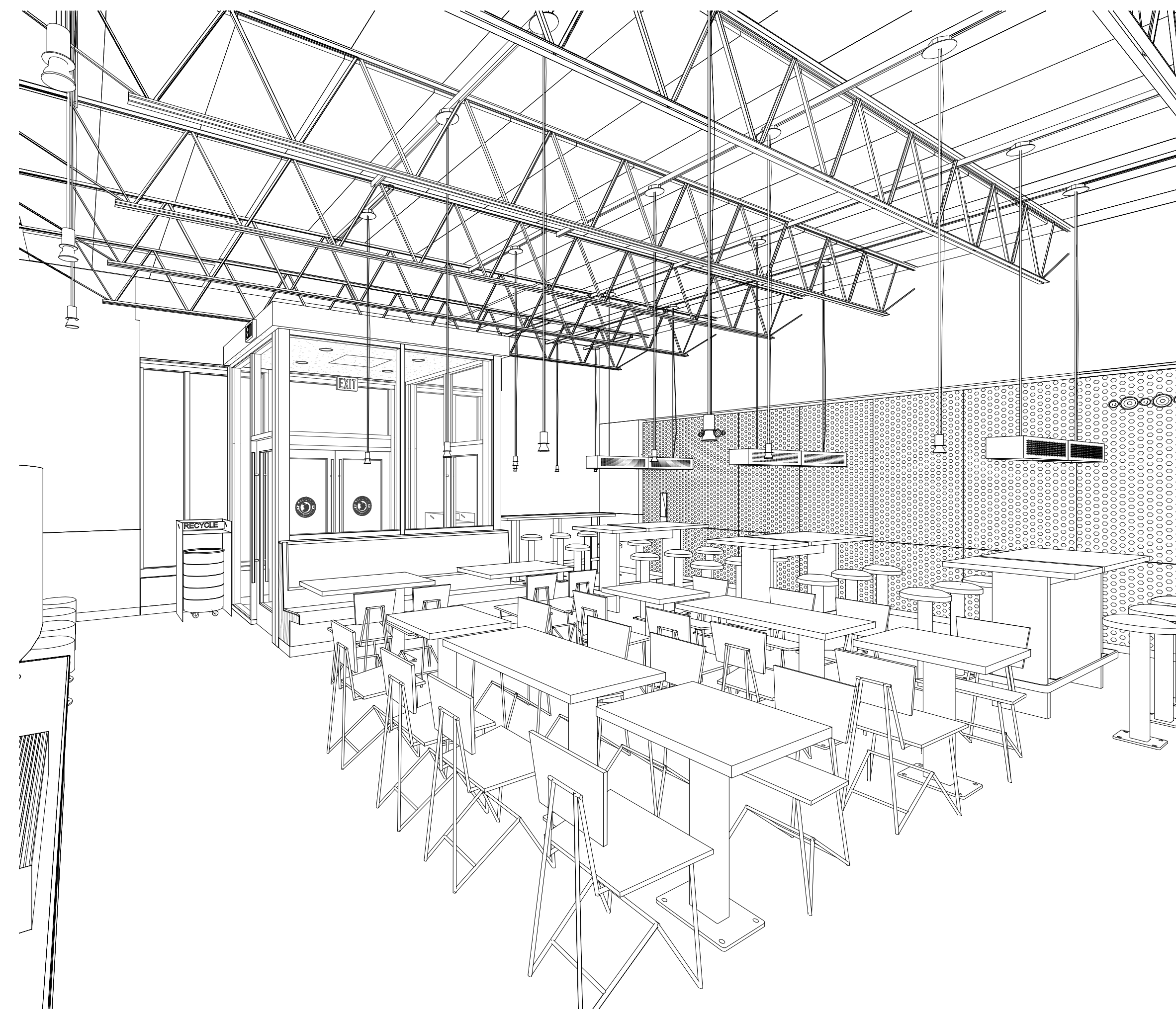
3 A400 PERSPECTIVE VIEW