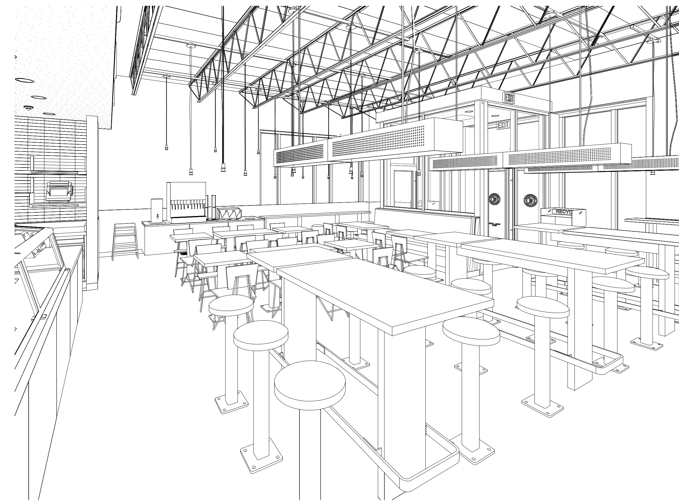
1 A400 PERSPECTIVE VIEW