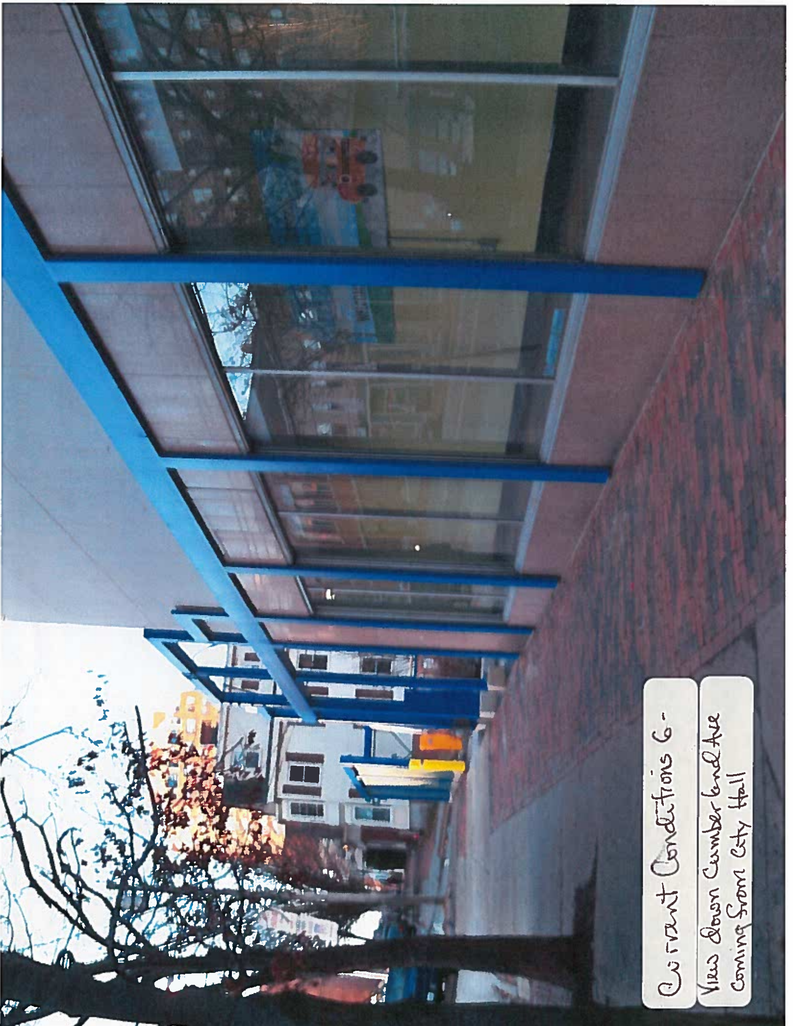
Current Conditions 6- View Down Cumberland Ave Coming from City Hall