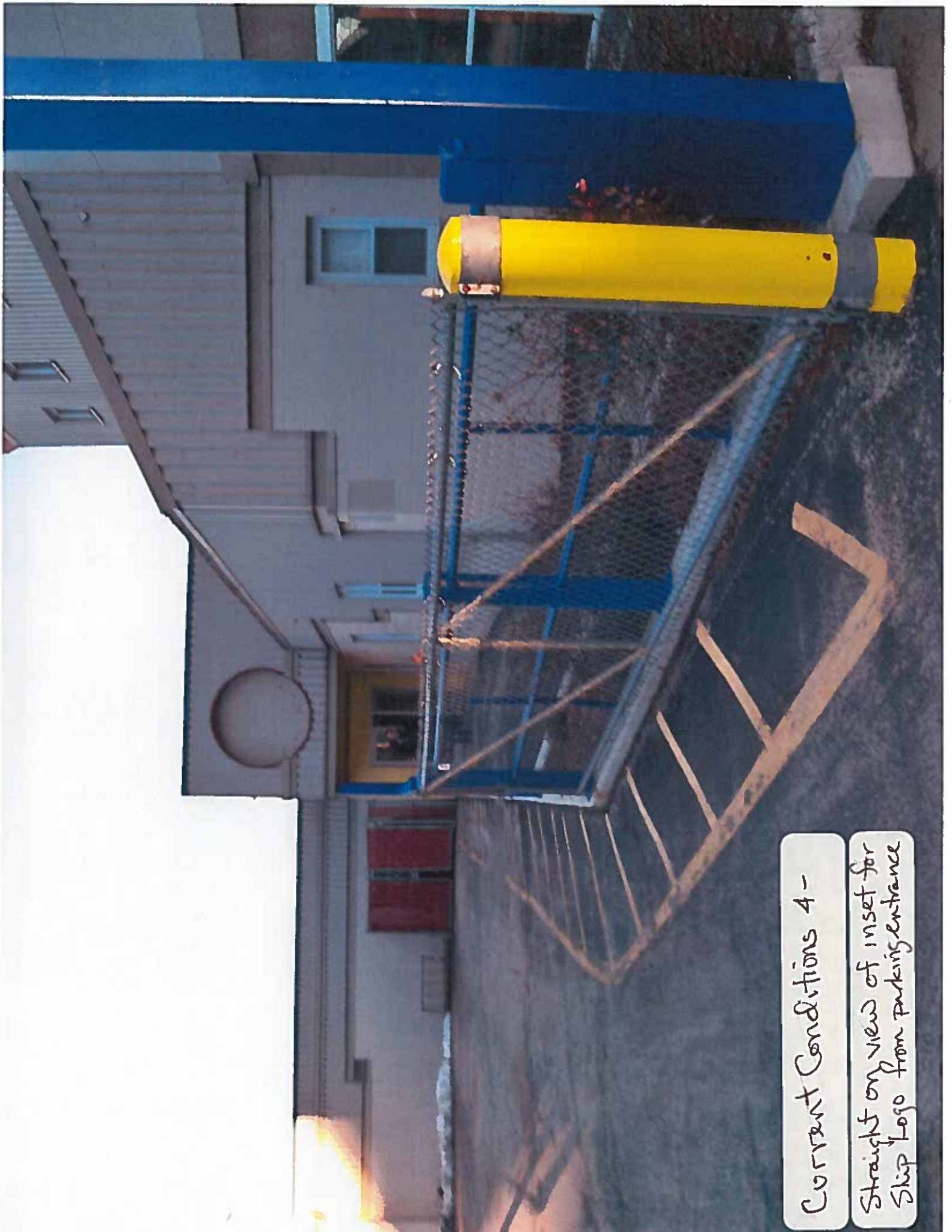
Current Conditions 4- Straight on view of inset for Slip Logo from parking entrance