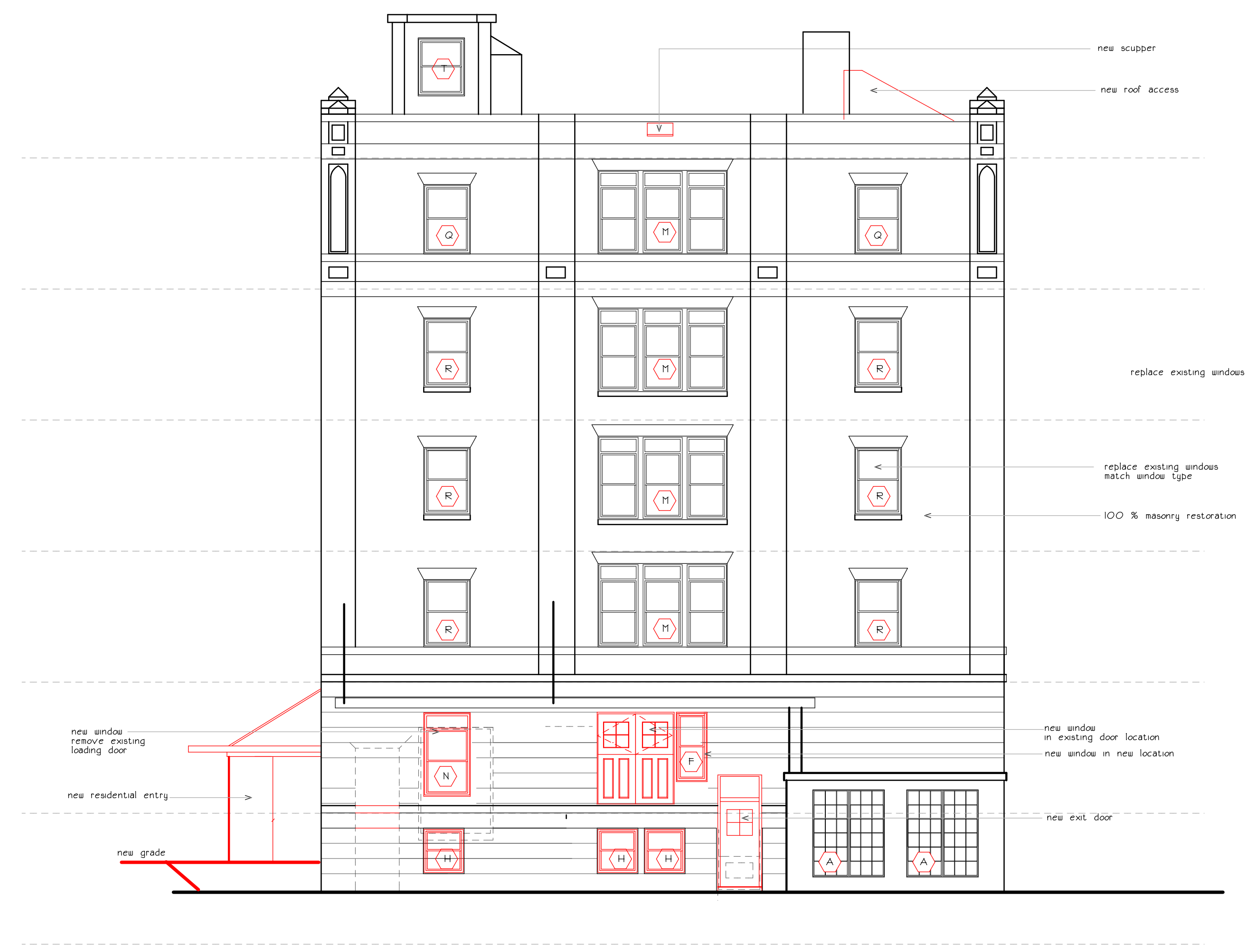
Elm St. elevation