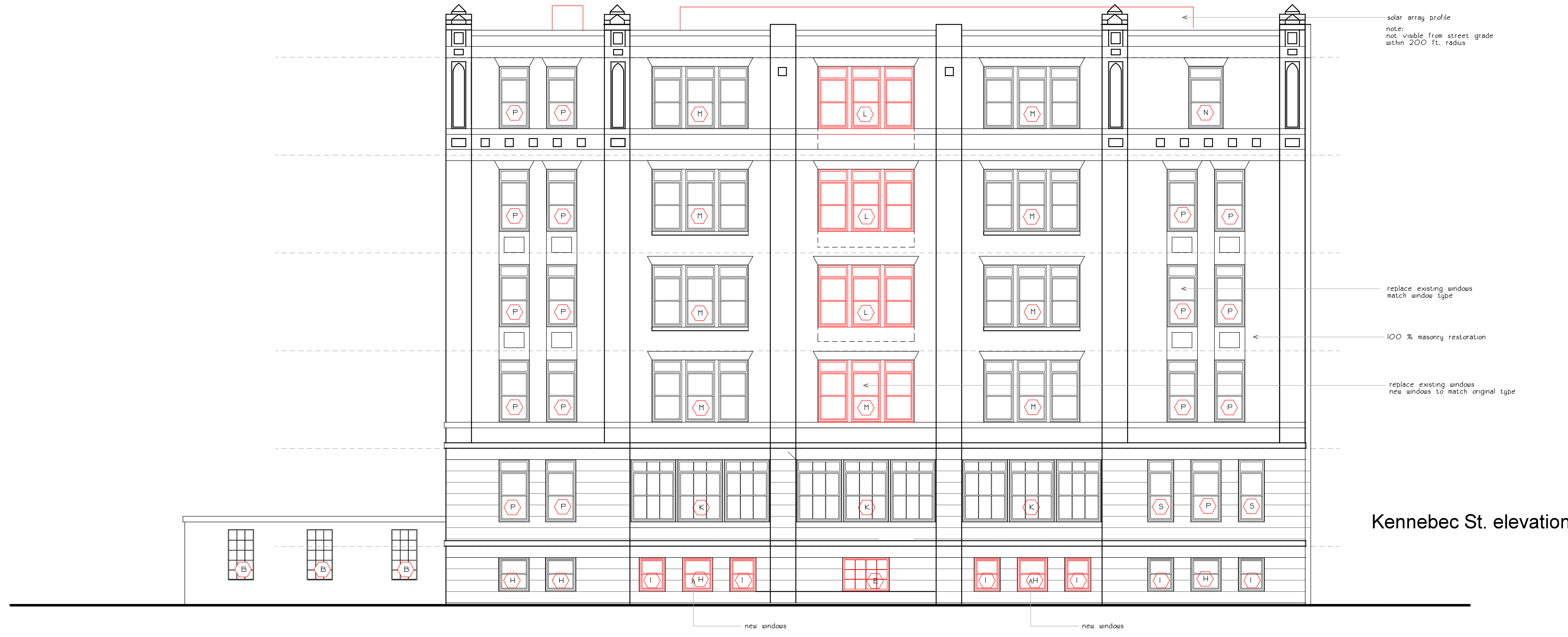
Kennebec St. elevation