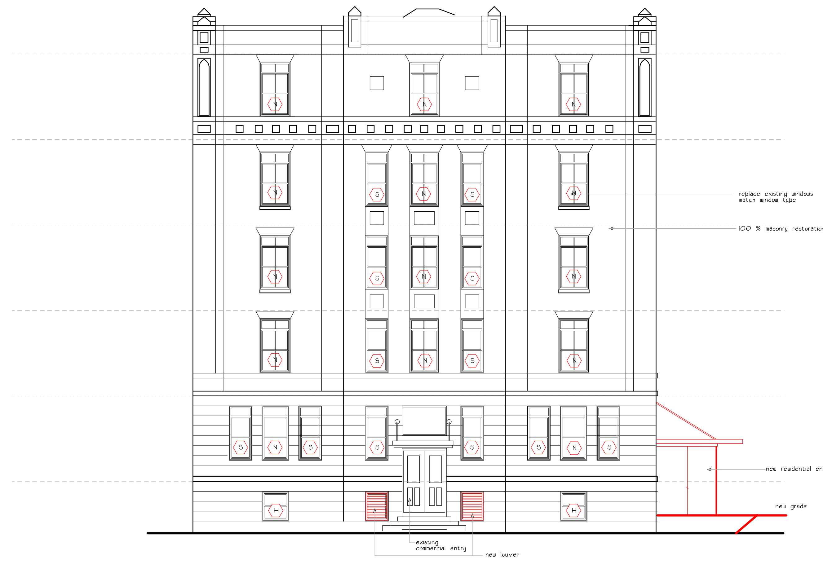
Preble st. elevation original entry elevation

CITY OF PORTLAND APPROVED SITE PLAN Subject to Conditions of Approval and Standard Conditions DATE OF APPROVAL 12.15.2015 PLANNER Shukria Wiar PROJECT NO. 2015-174