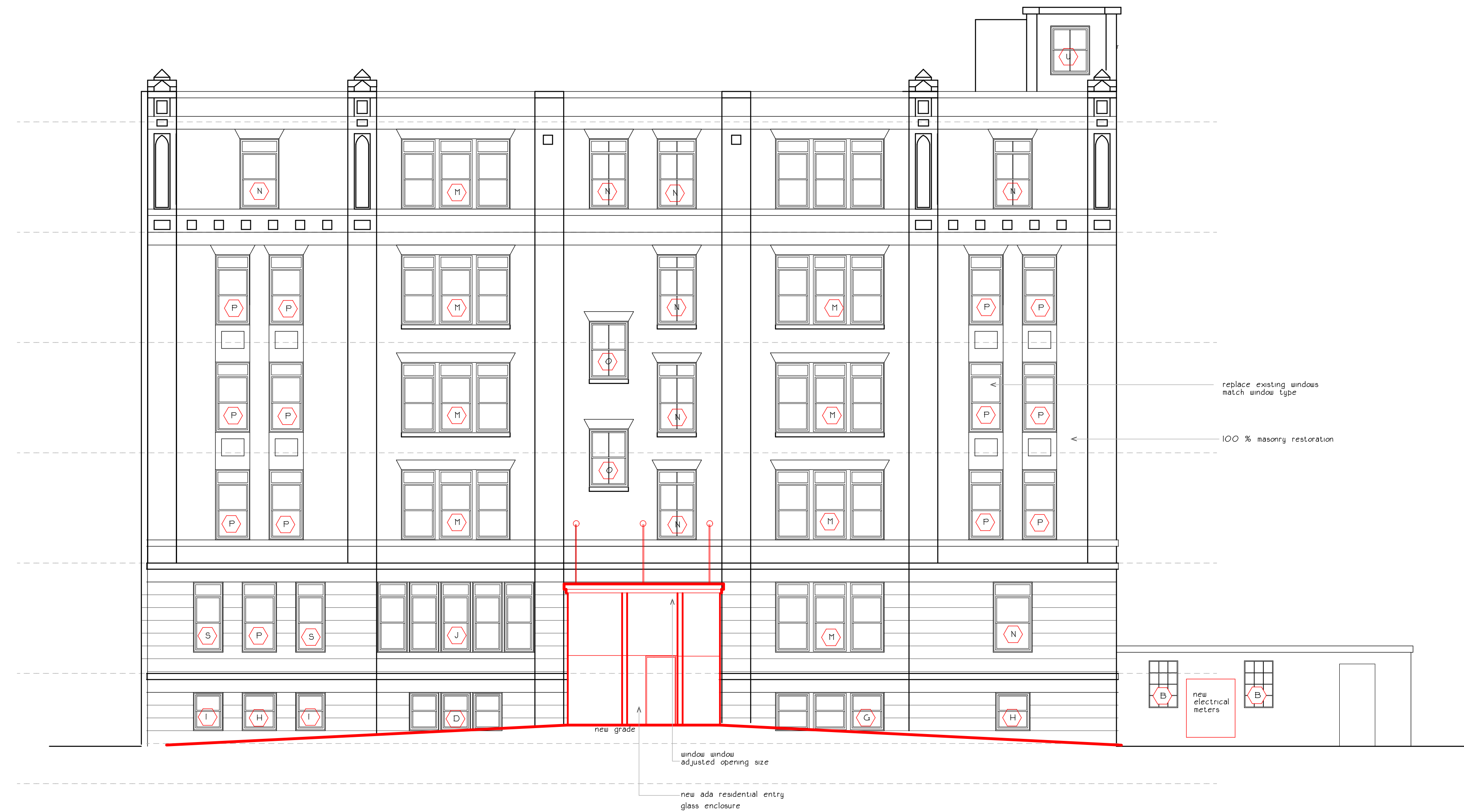
South elevation Residential entry