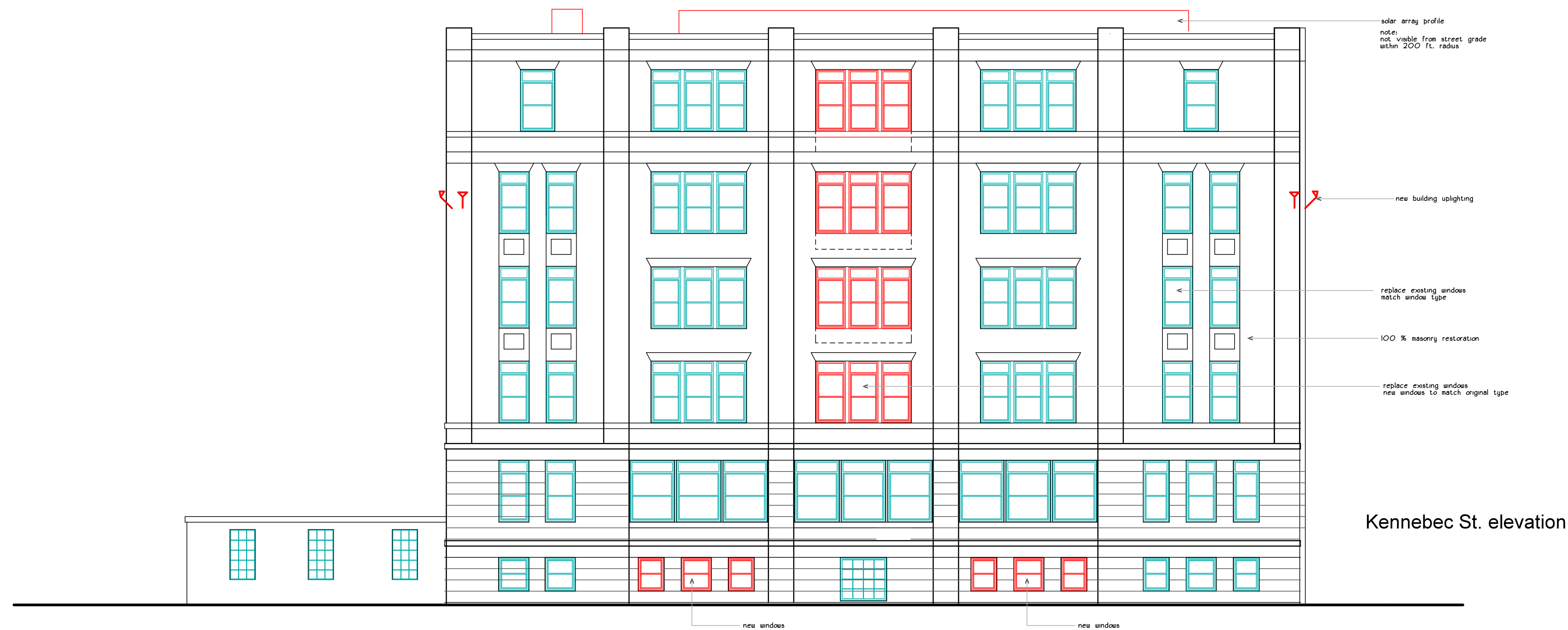
Kennebec St. elevation