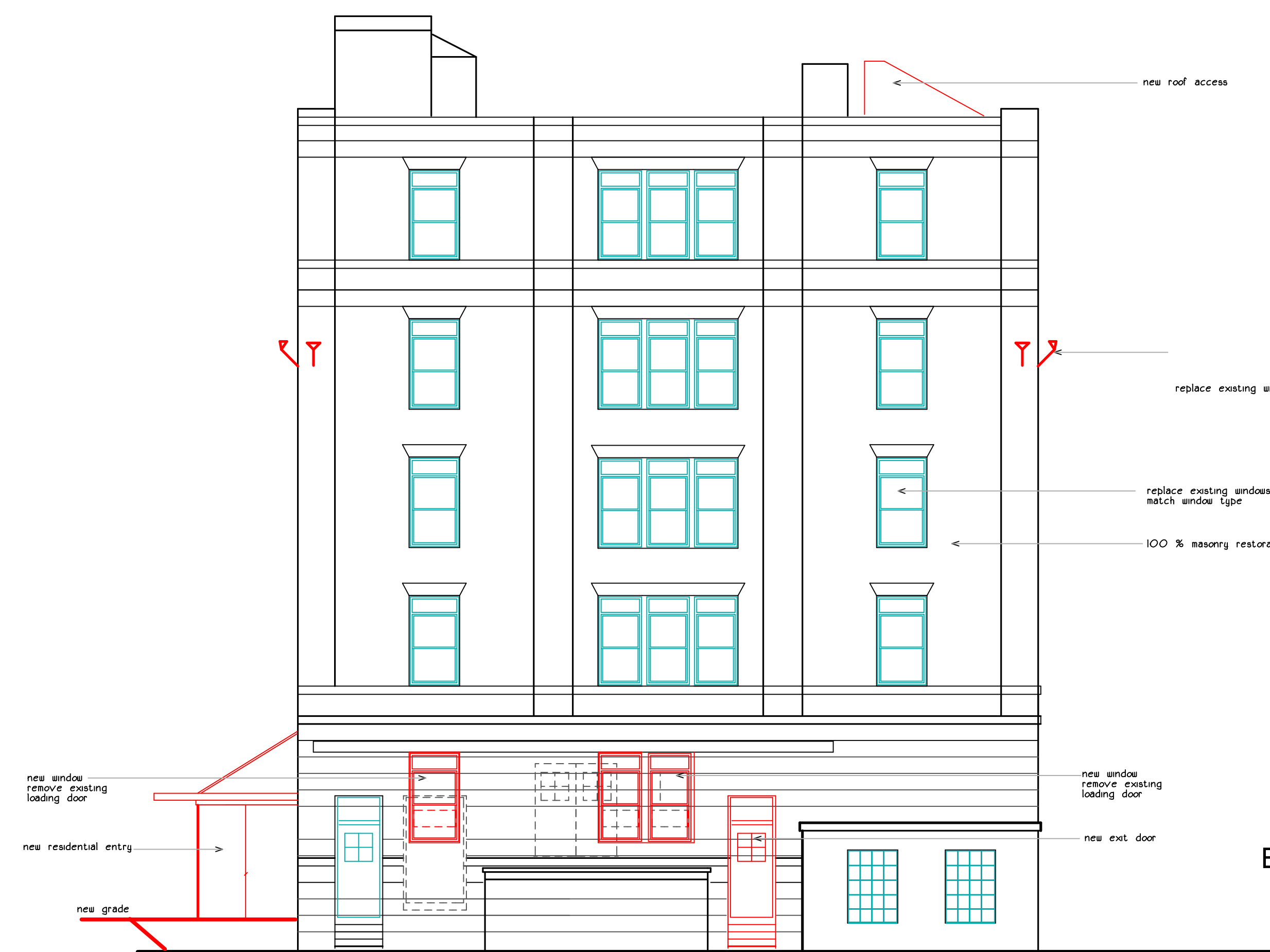
Elm St. elevation