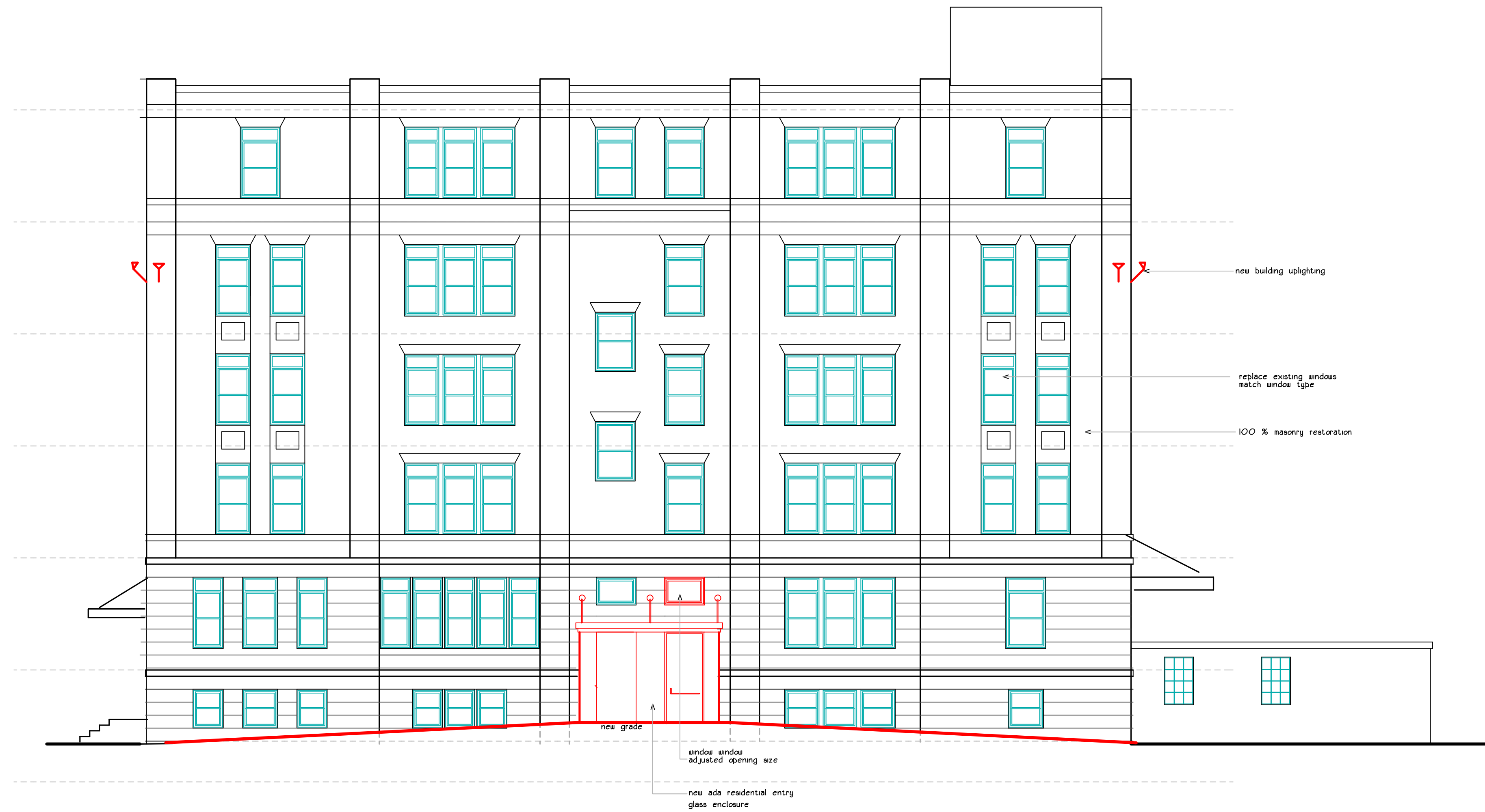
South elevation Residential entry