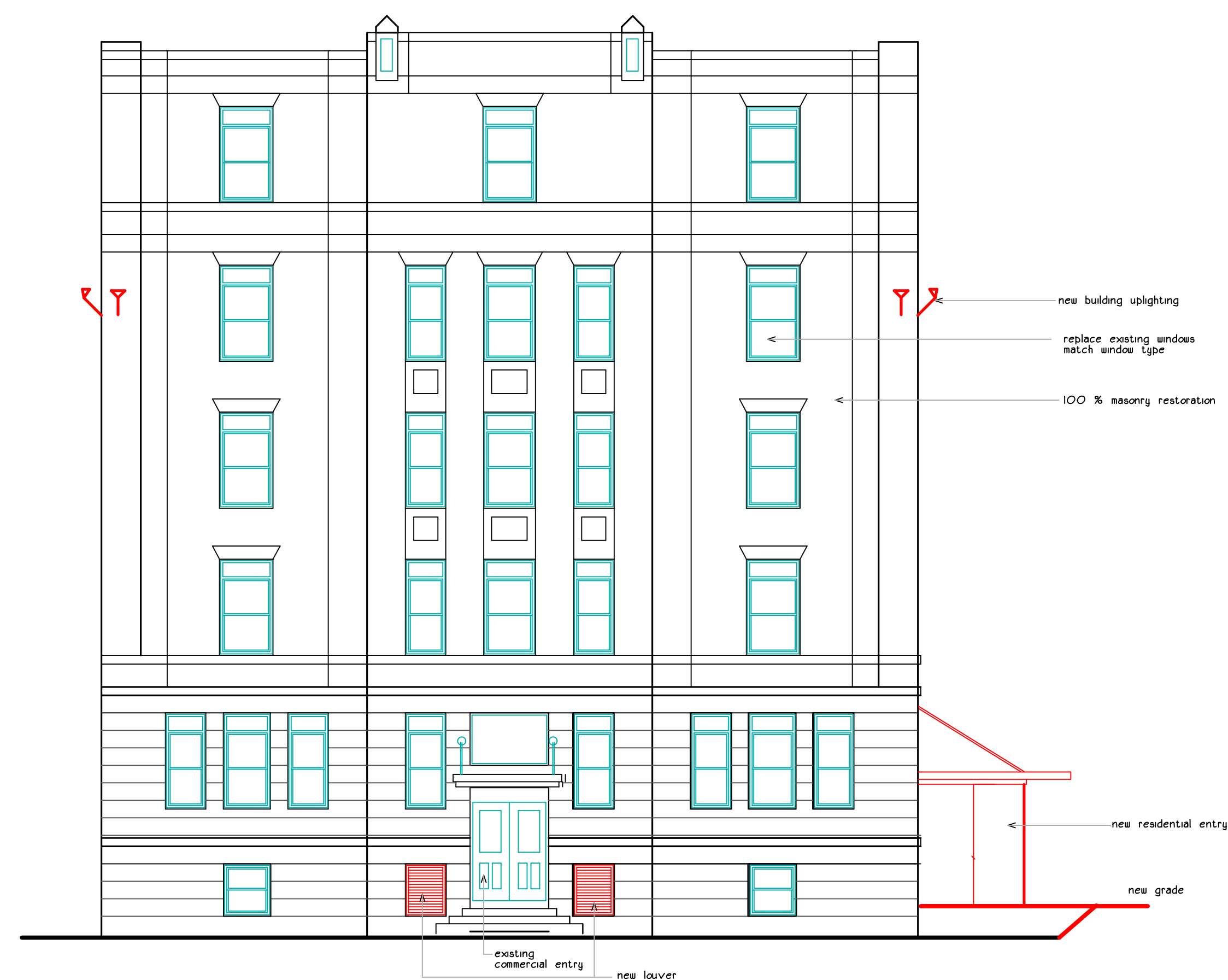
Prebble elevation original entry elevation