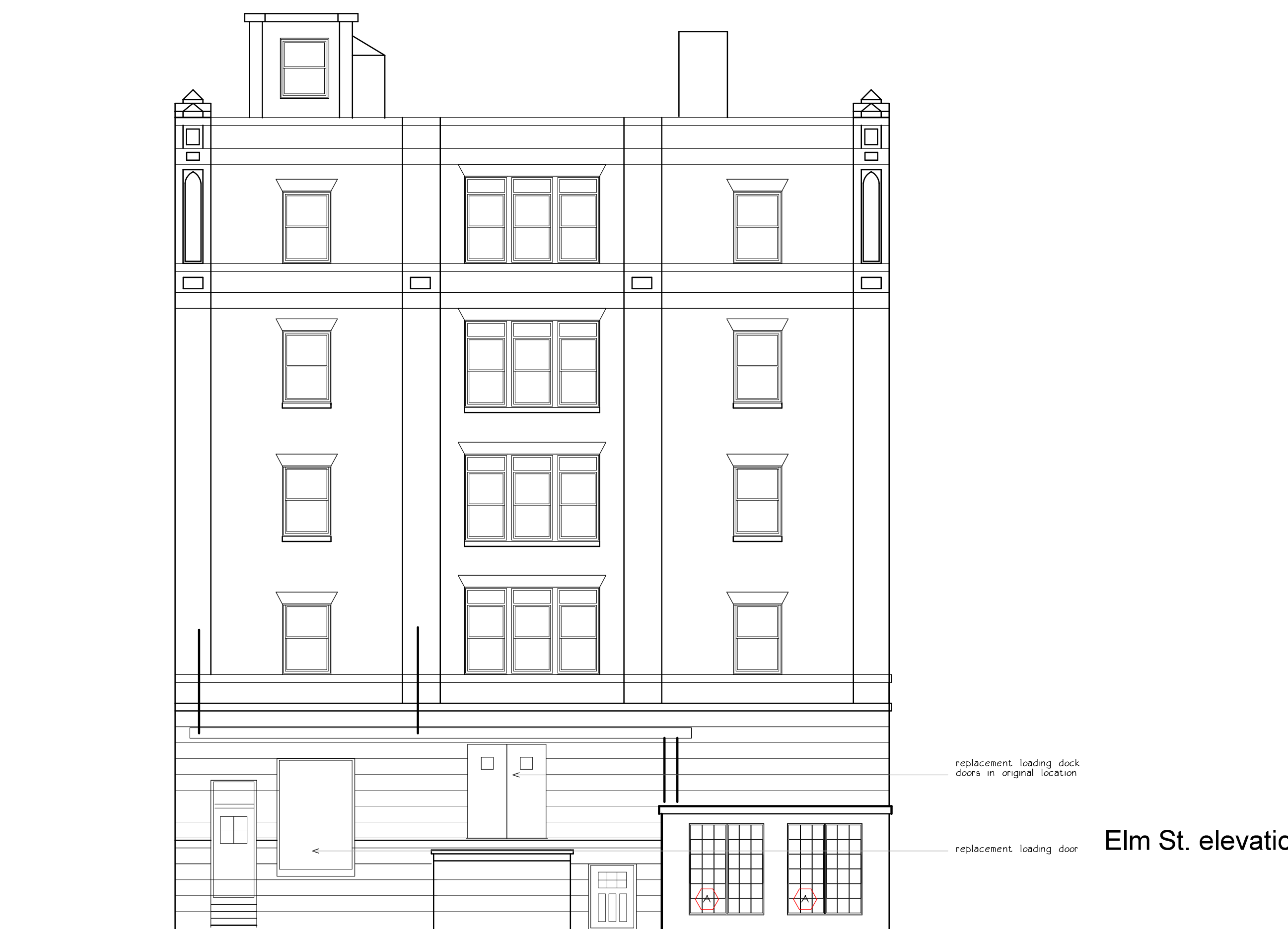
Elm St. elevation