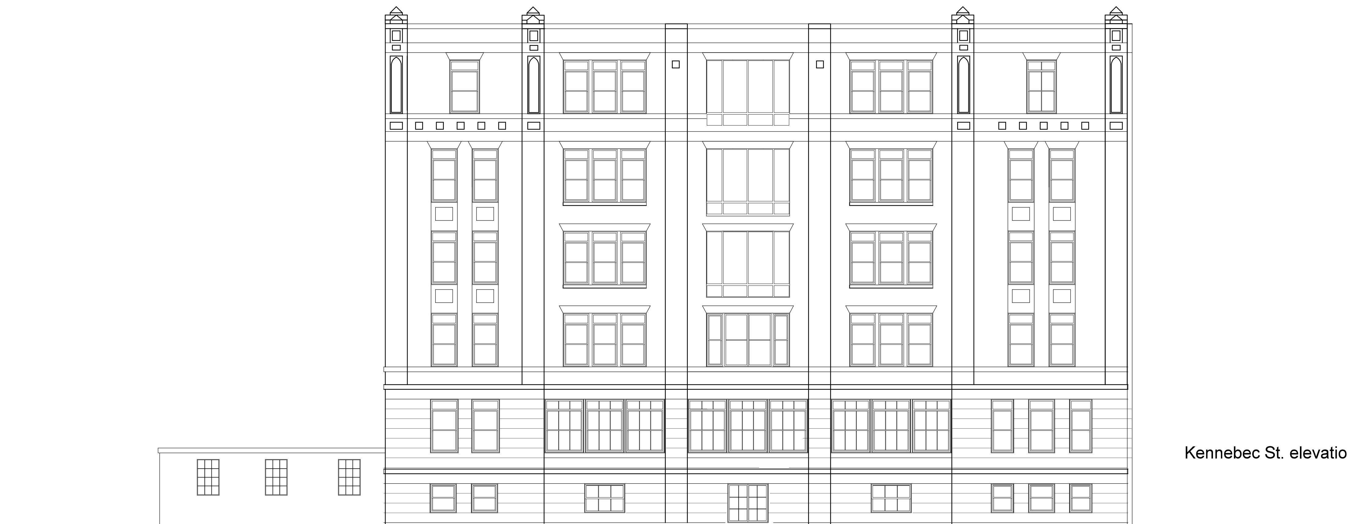
Kennebec St. elevation