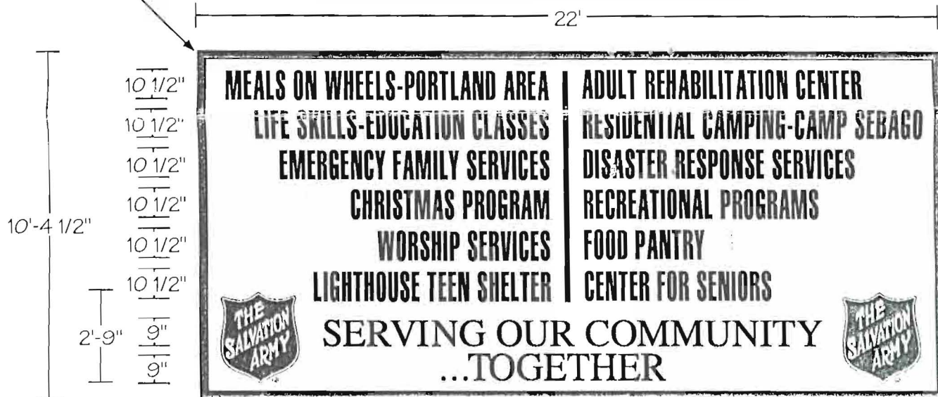
TYP. ELEVATION 1/4"=1'-0"