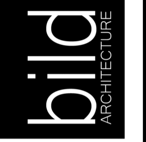
Bild Architecture PO Box 8235 Portland, ME 04104 207.408.0168 evan@bildarchitecture.com