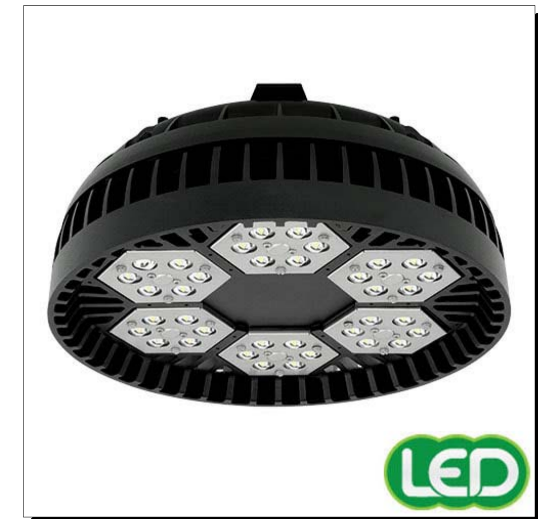
HUBBELL GARAGE LED