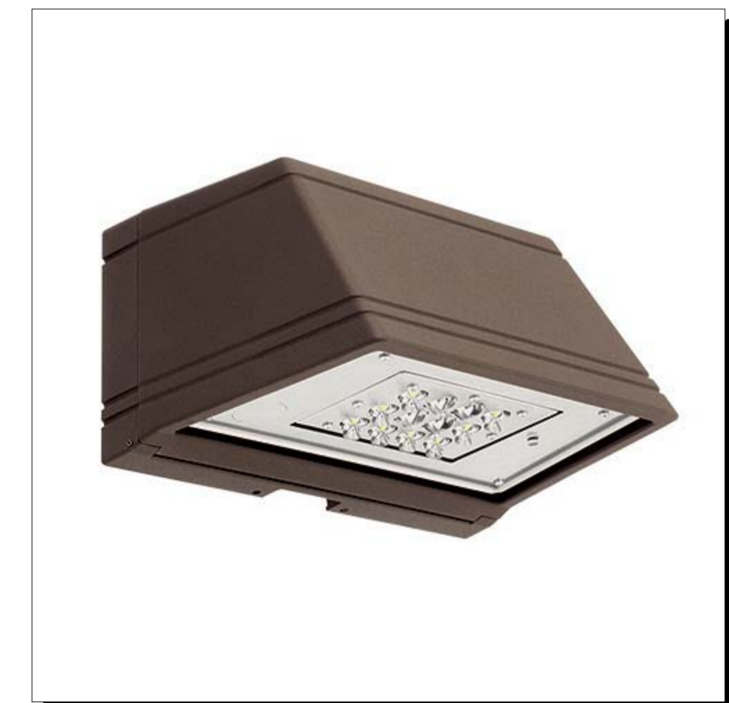
HUBBELL WALL PACK