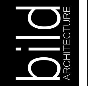
Bild Architecture PO Box 8235 Portland, ME 04104 207.408.0168 evan@bildarchitecture.com