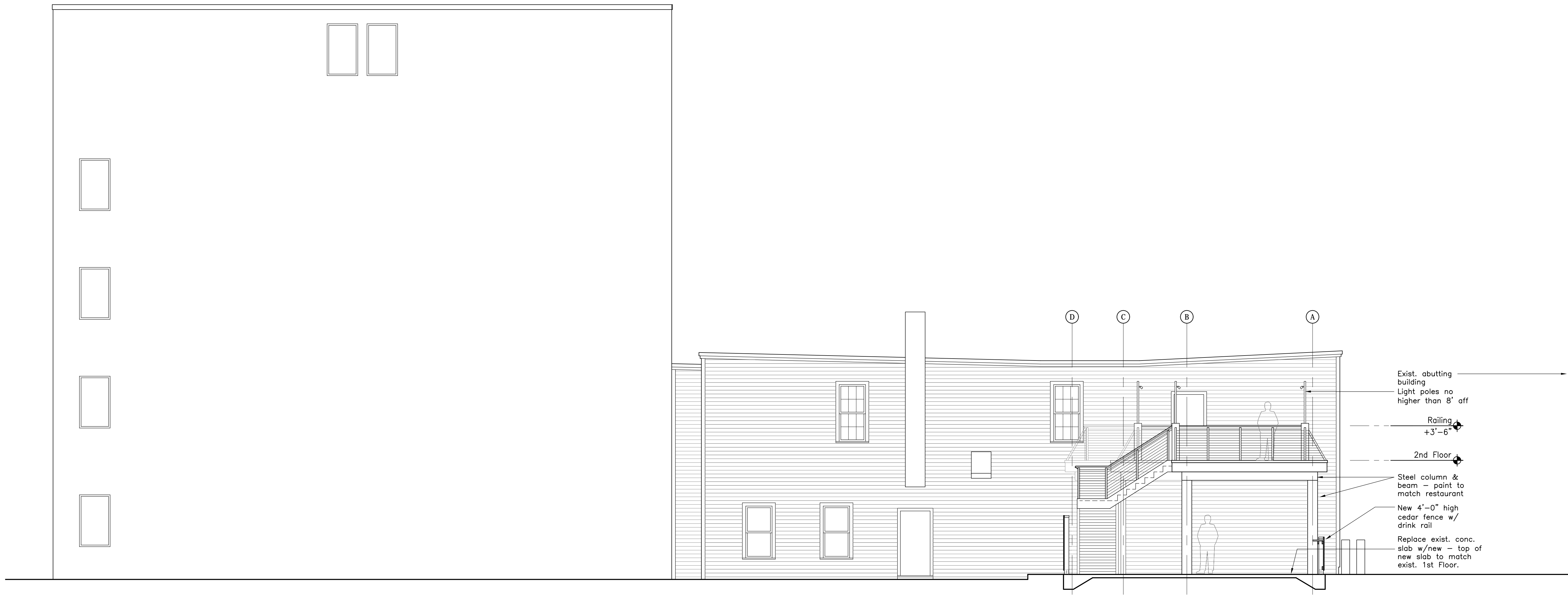
1 Proposed East Elevation Scale: 3/16" = 1'-0"