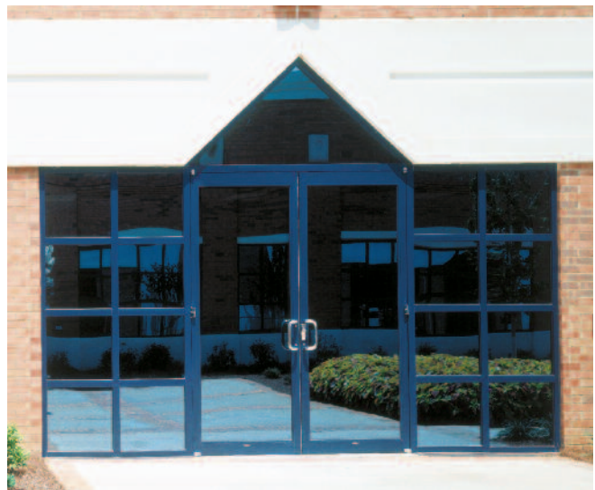
TSYS North Center, Columbus, GA Architect: C.S.I. Architects, Columbus, GA Glazing Contractor: Uneeda Glass Co., Columbus, GA