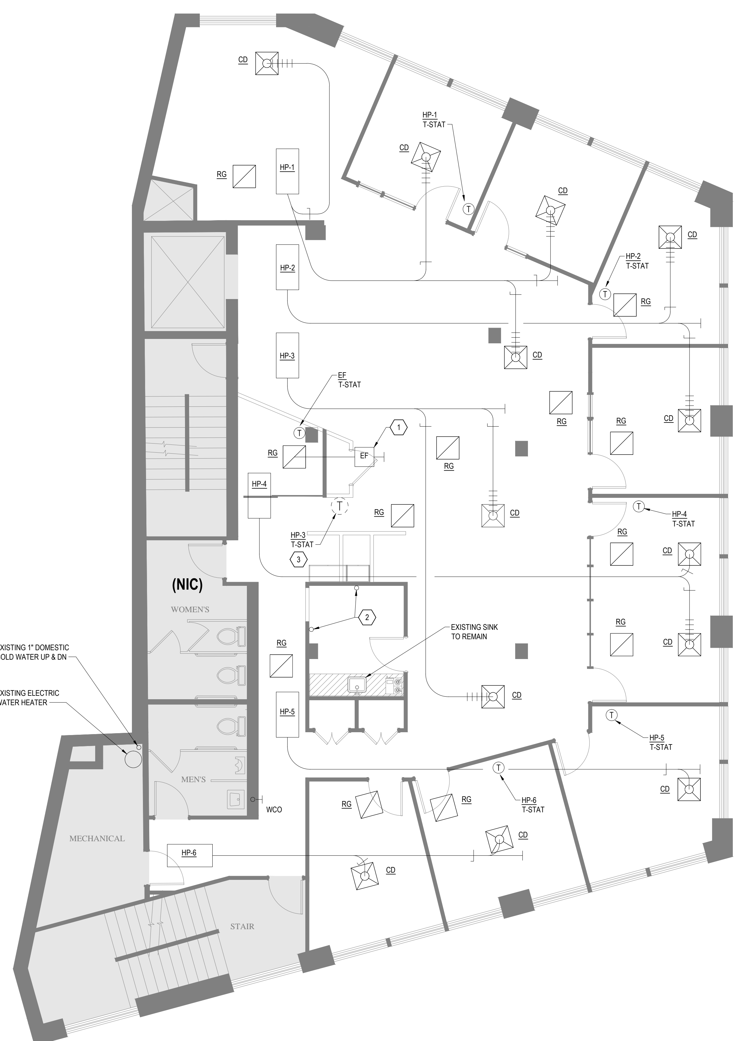
1 SECOND FLOOR DEMOLITION PLAN SCALE 3/16"=1'-0"

MONAGHAN WOODWORKS 100 COMMERCIAL STREET SUITE #212 PORTLAND, ME 04101 Tel 207.775.2693 Fax 207.772.6735