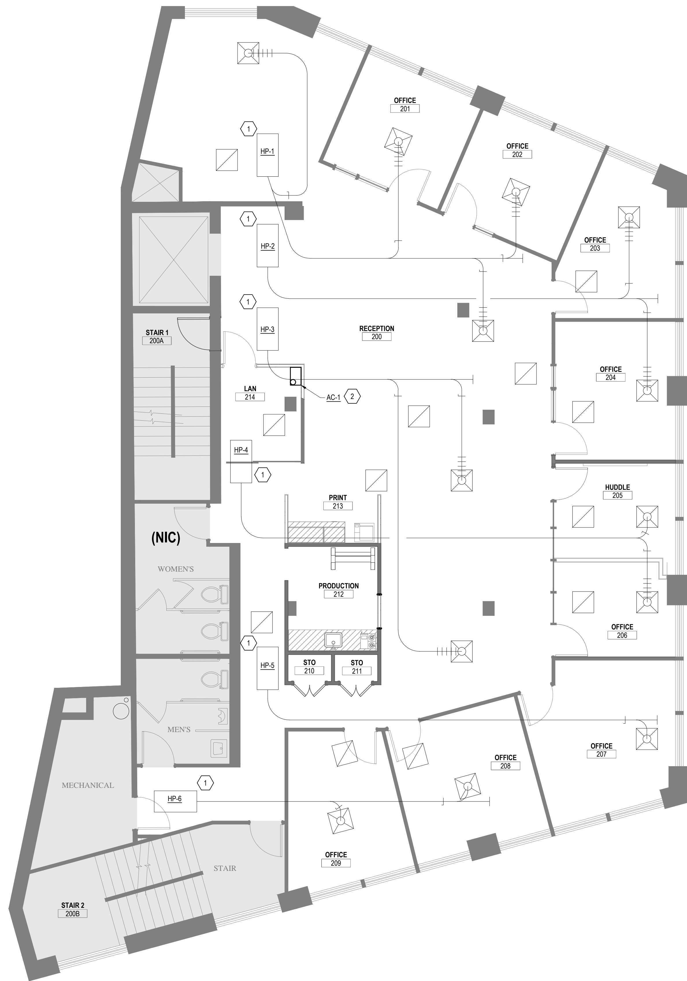
1 SECOND FLOOR HVAC PLAN SCALE: 3/16" = 1'-0"

MONAGHAN WOODWORKS 100 COMMERCIAL STREET SUITE #212 PORTLAND, ME 04101 Tel: 207.775.2663 Fax: 207.772.6726