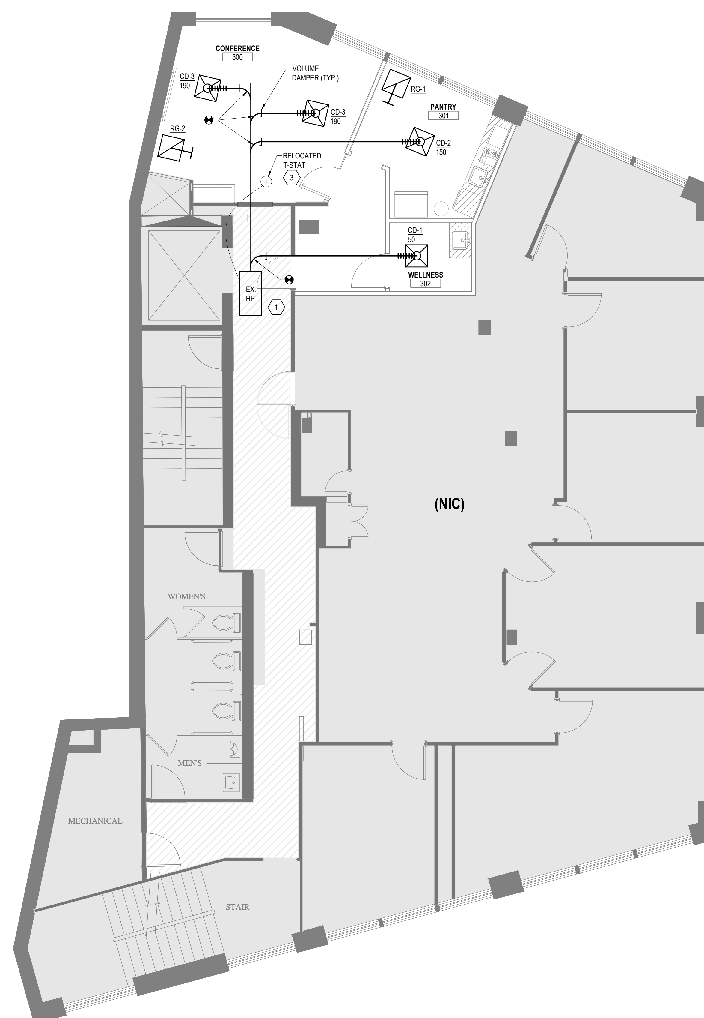
2 THIRD FLOOR HVAC PLAN SCALE: 3/16" = 1'-0"