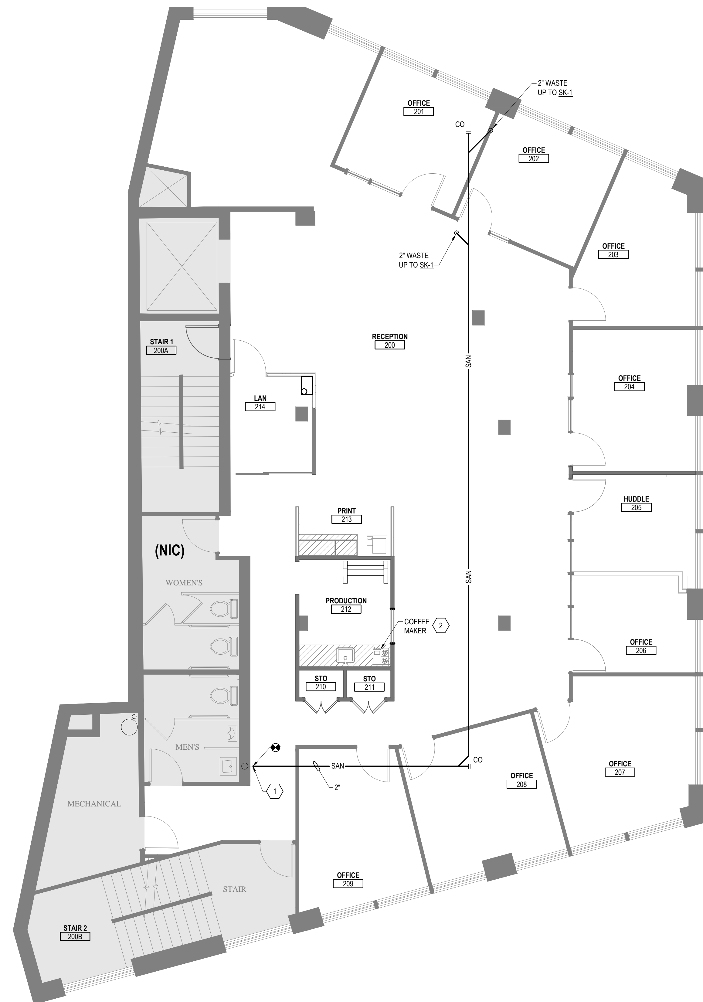
1 SECOND FLOOR PLUMBING PLAN SCALE 3/16"=1'-0"