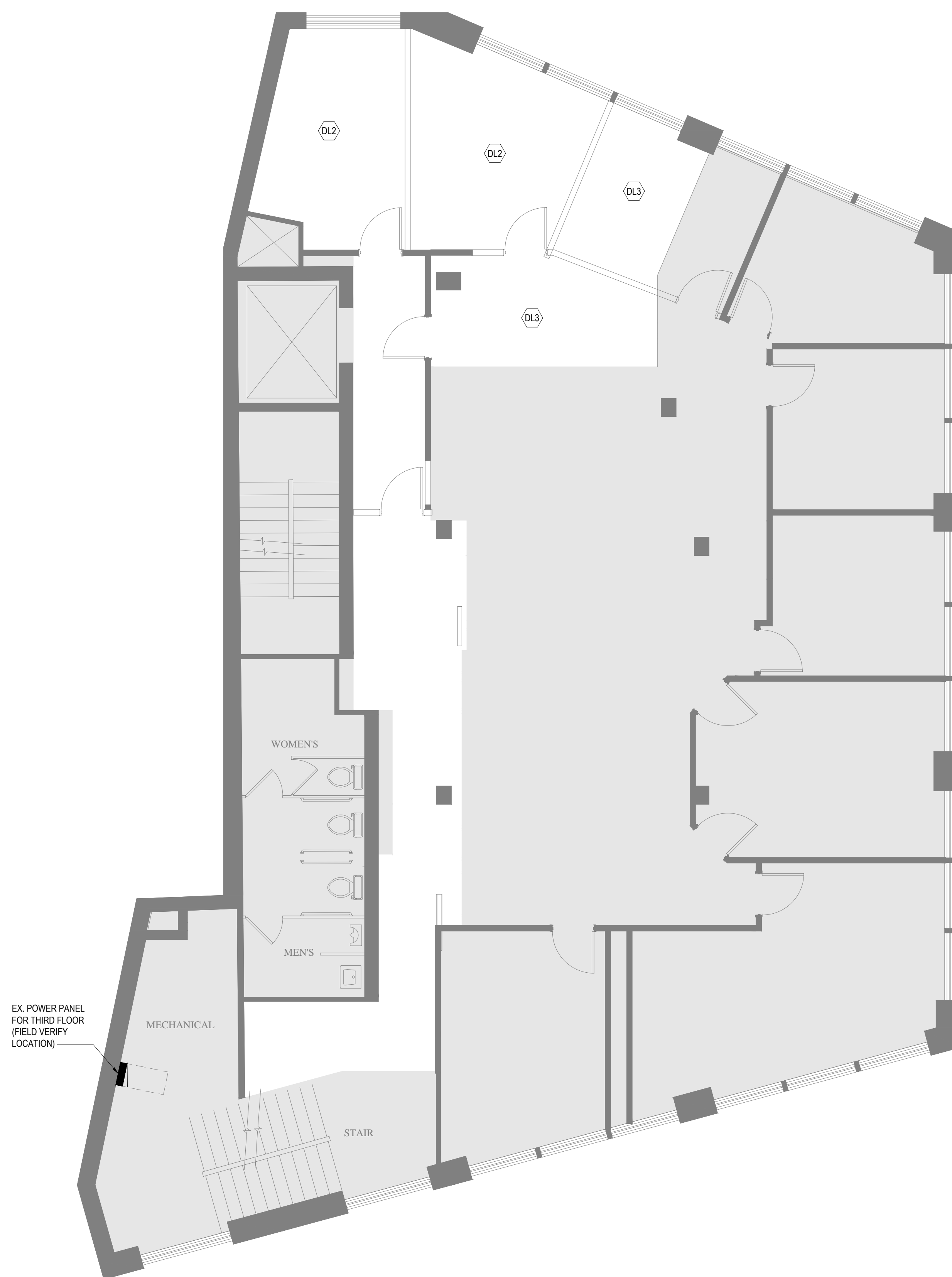
2 THIRD FLOOR LIGHTING DEMOLITION PLAN SCALE: 3/16"=1'-0"