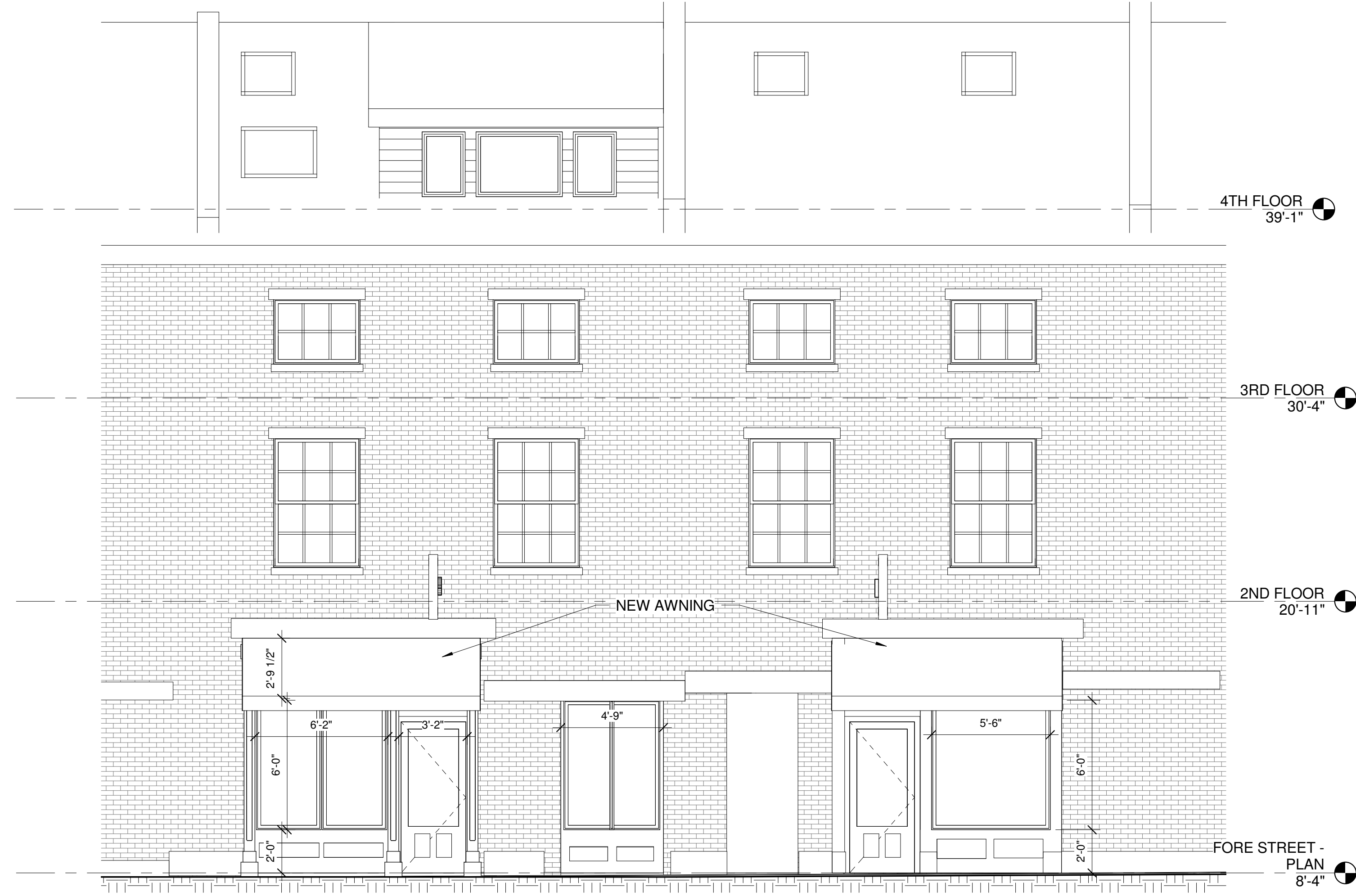
2 FORE STREET - ELEVATION 1/4" = 1'-0"

NOTES: -WINDOWS TO BE REPLACED ON ALL UPPER FLOORS WITH UNIVERSAL 400 HISTORIC SERIES ALUMINUM, BLACK FRAME. -EXISTING WOOD PANELING TO BE REPAINTED