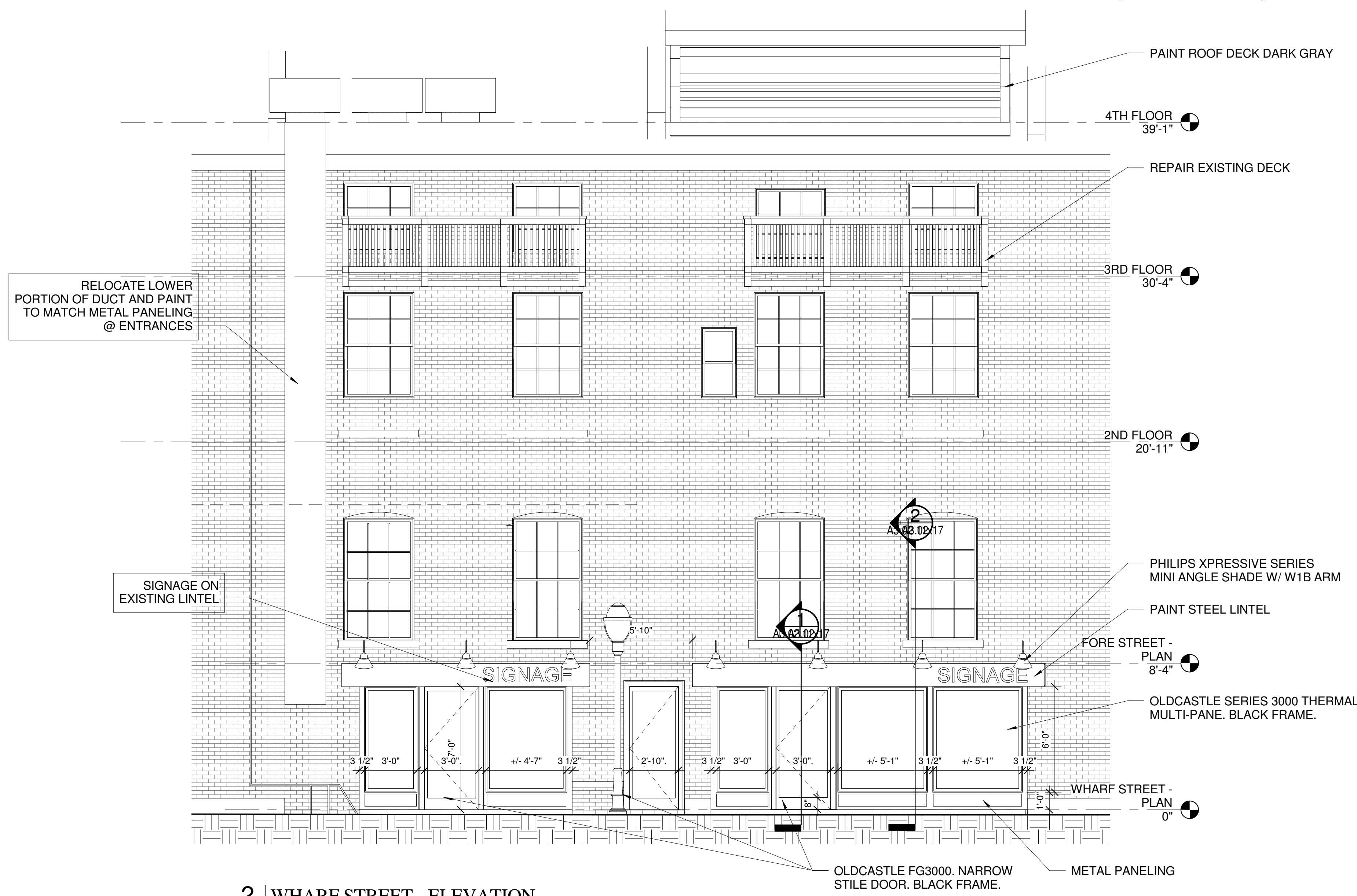
2 WHARF STREET - ELEVATION 1/4" = 1'-0"

NOTES: -WINDOWS TO BE REPLACED ON ALL UPPER FLOORS W/ UNIVERSAL SERIES 400 HISTORIC ALUMINUM WINDOWS. BLACK FRAME AND MULLIONS -REPAIR ENTRANCE PADS -REPAIR DAMAGED TRIM AND PANELING