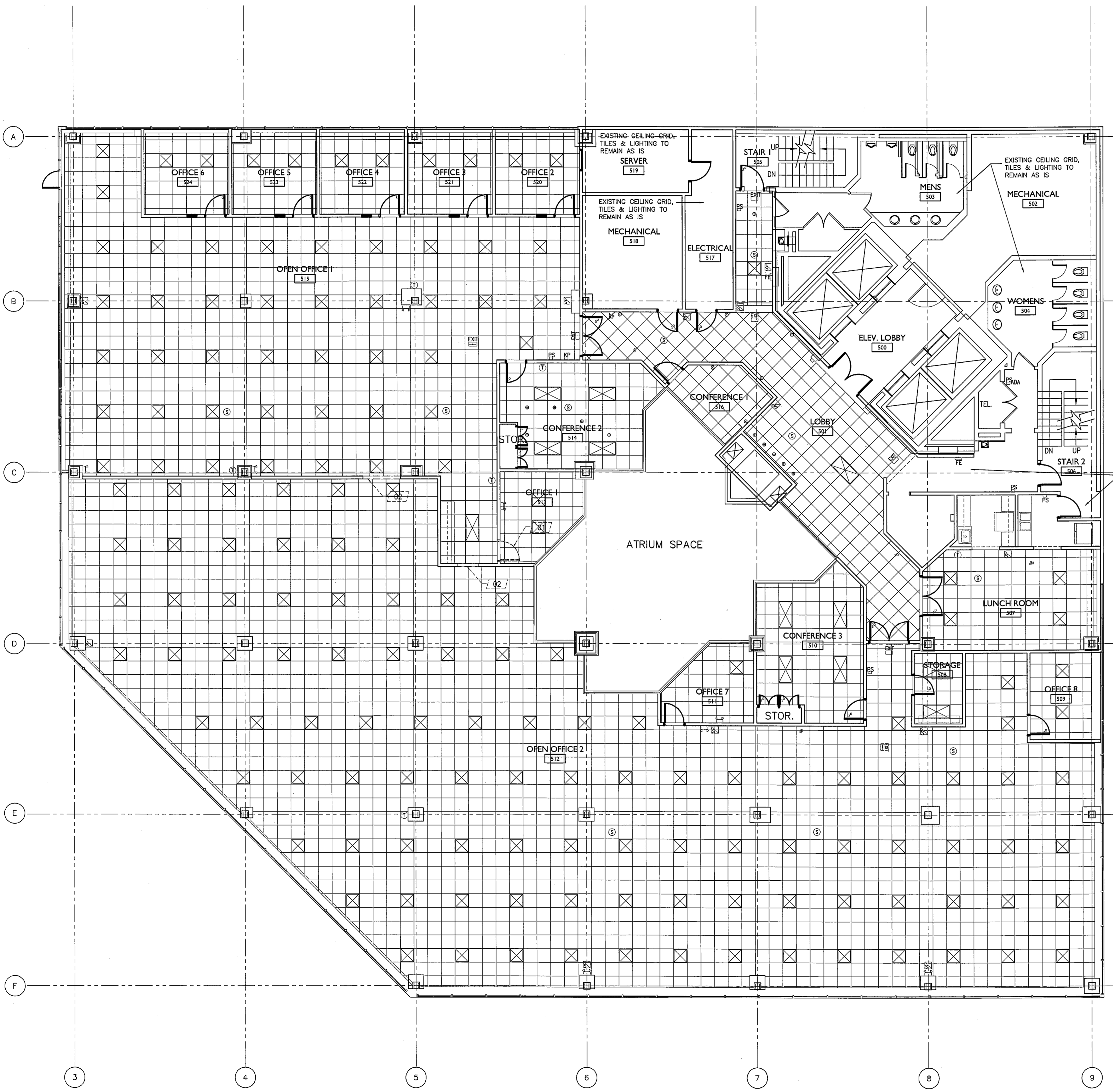
A1 FIFTH FLOOR EXISTING CONDITIONS REFLECTED CEILING PLAN - LIFE SAFETY

© COPYRIGHT 1985-2003 REPRODUCTION OR RESUE OF THIS DOCUMENT WITHOUT WRITTEN PERMISSION OF GAWRON ARCHITECTS IS PROHIBITED