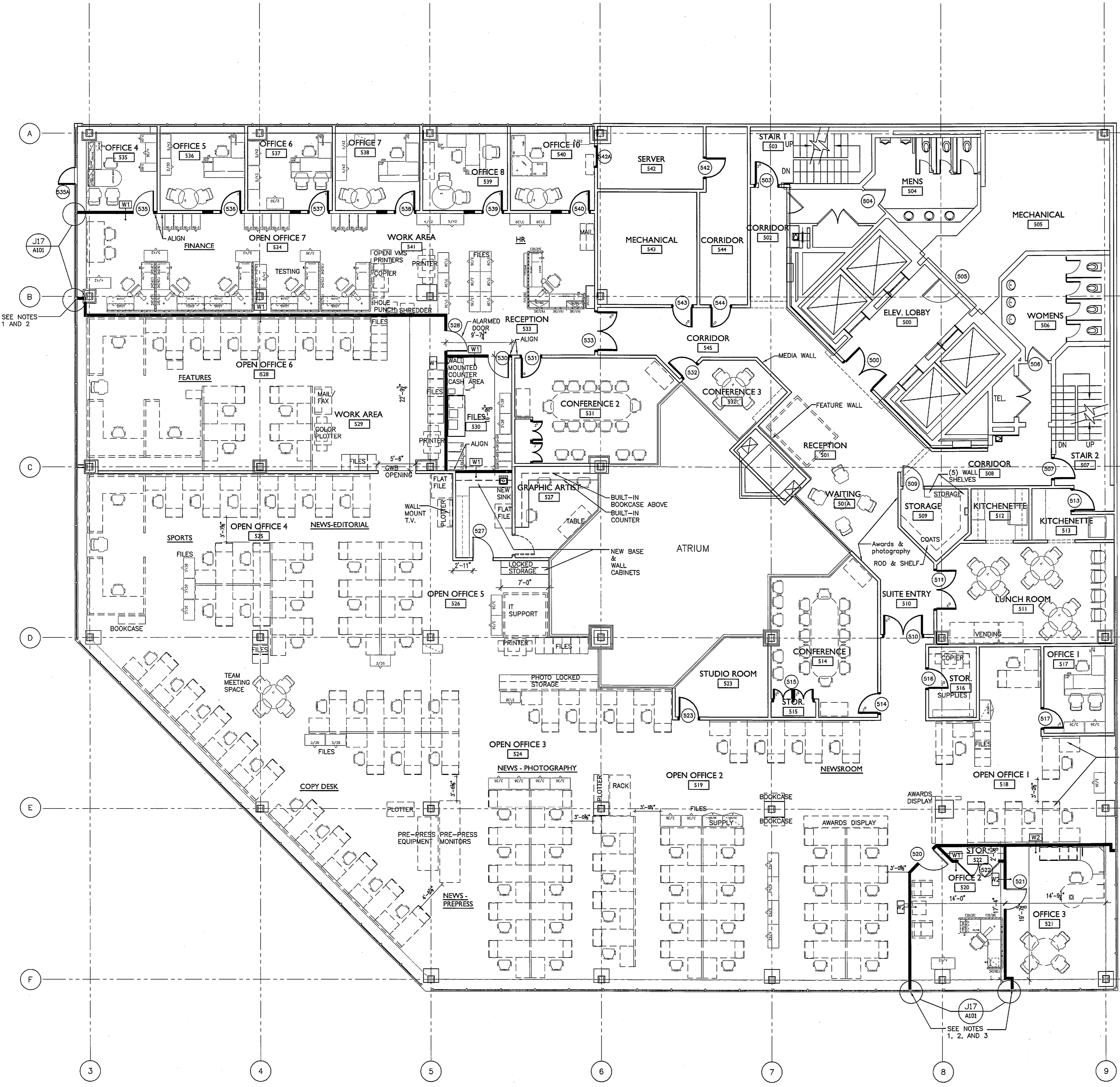
A1 FIFTH FLOOR PLAN