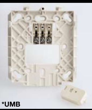
Common base for wall and ceiling with 5 mounting options