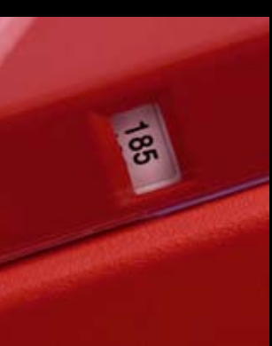
8 candela settings