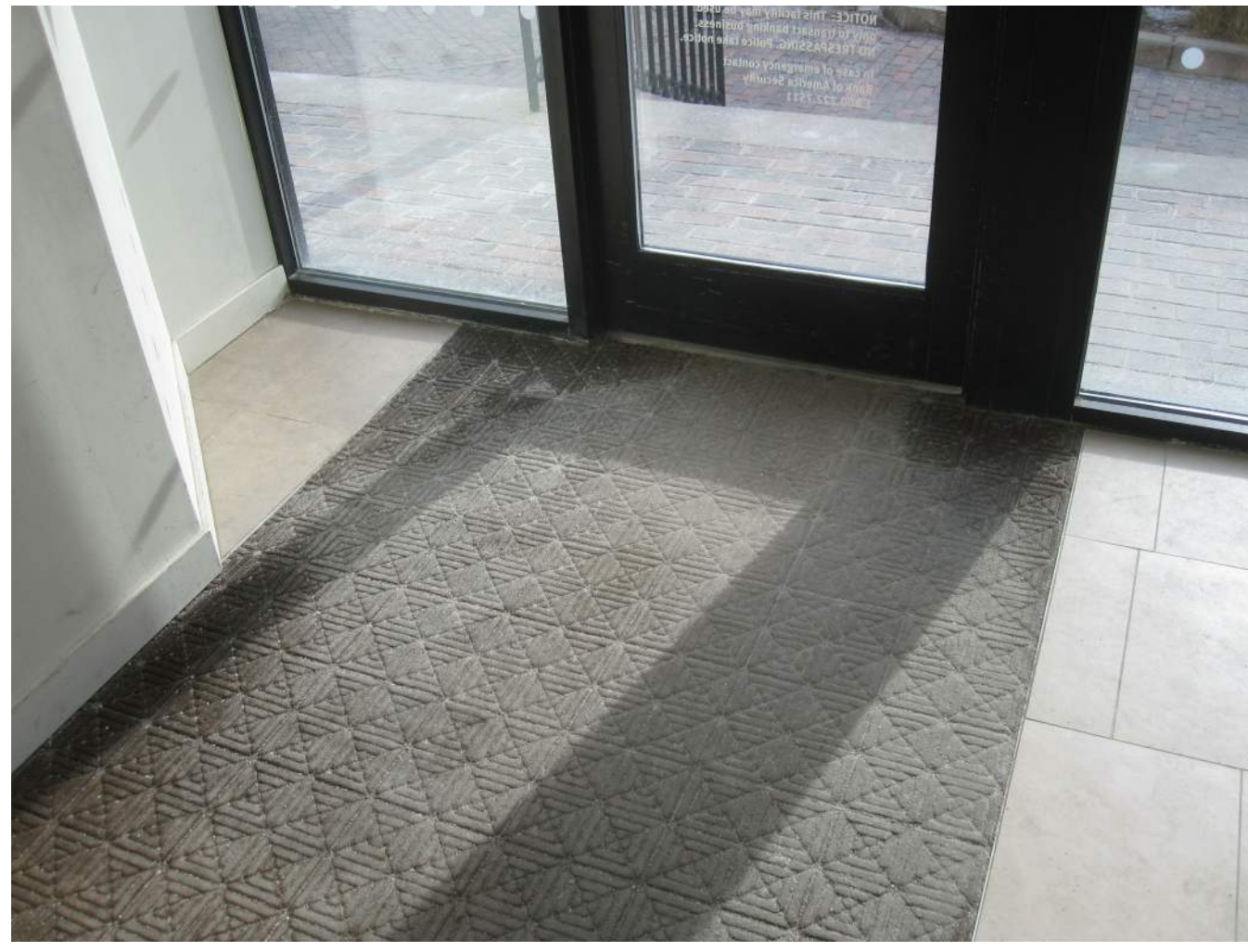
ADJUST DOOR PULL, REPLACE THRESHOLD, & REPLACE WALK-OFF MAT