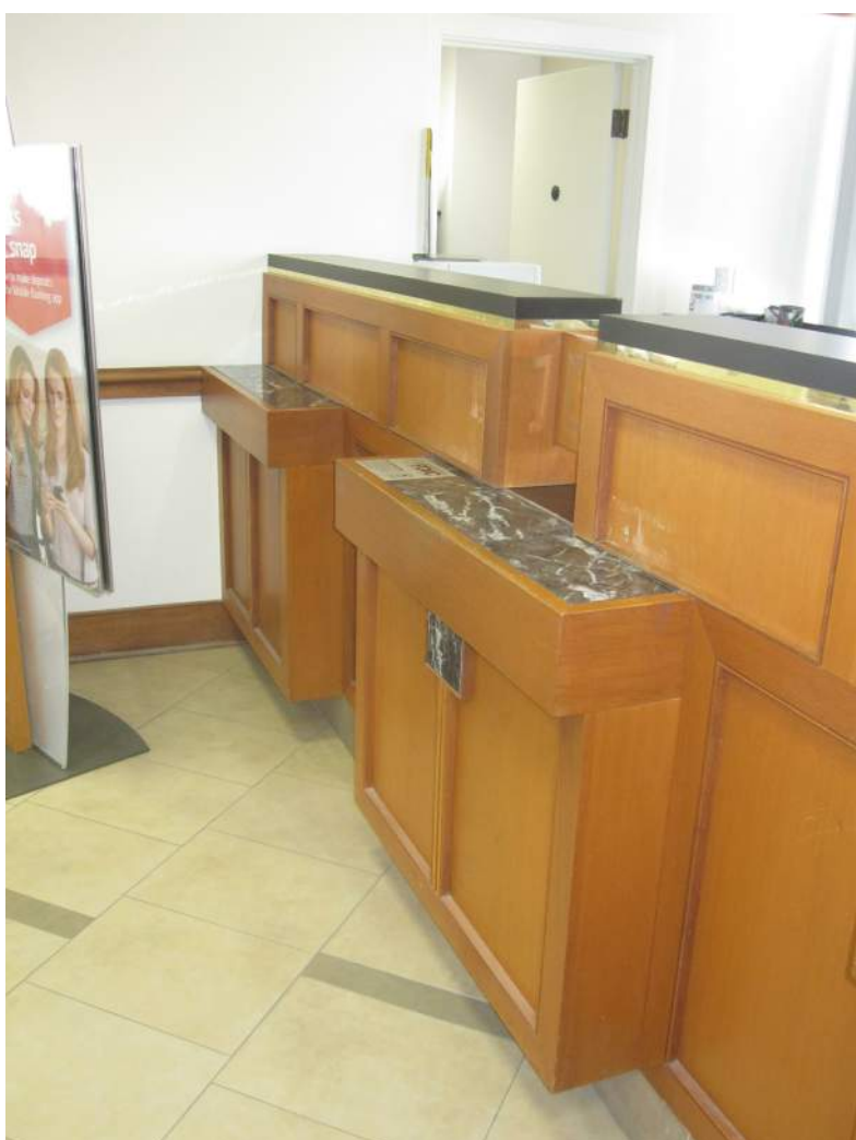
PROVIDE NEW ADA COMPLIANT TELLER STATION