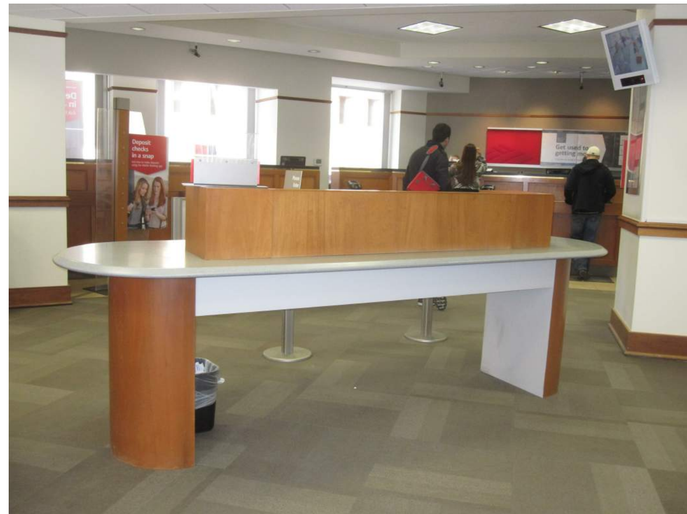
PROVIDE NEW ADA COMPLIANT CHECK DESKS