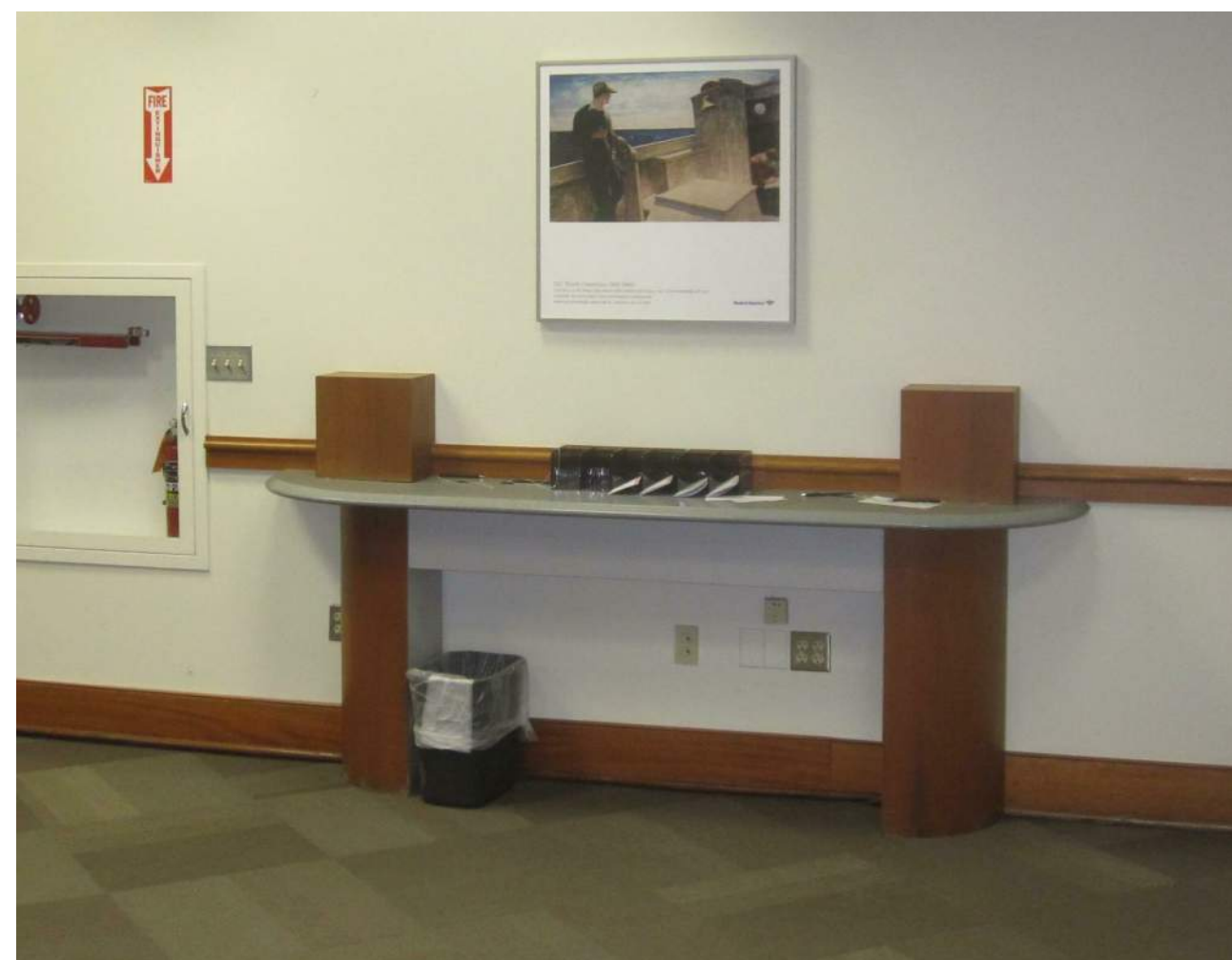
REPLACE NON-COMPLIANT CHECK DESK WITH RELOCATED ADA COMPLIANT CHECK DESK