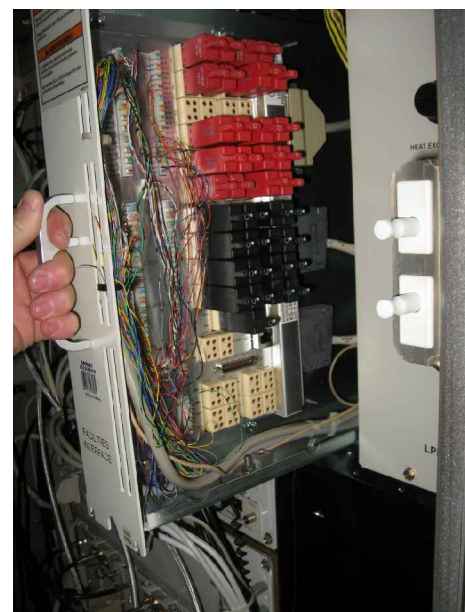
EXISTING TELCO CABINET 4 T-2