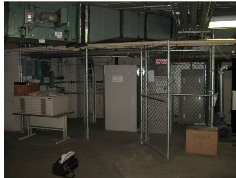
EXISTING EQUIPMENT AREA 3 T-2