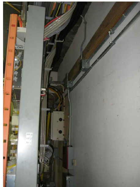
PROPOSED MEET POINT 2 T-2