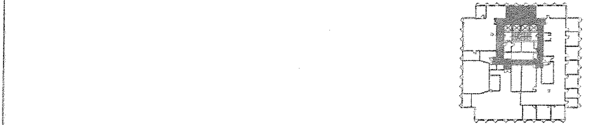
A18 KEY PLAN