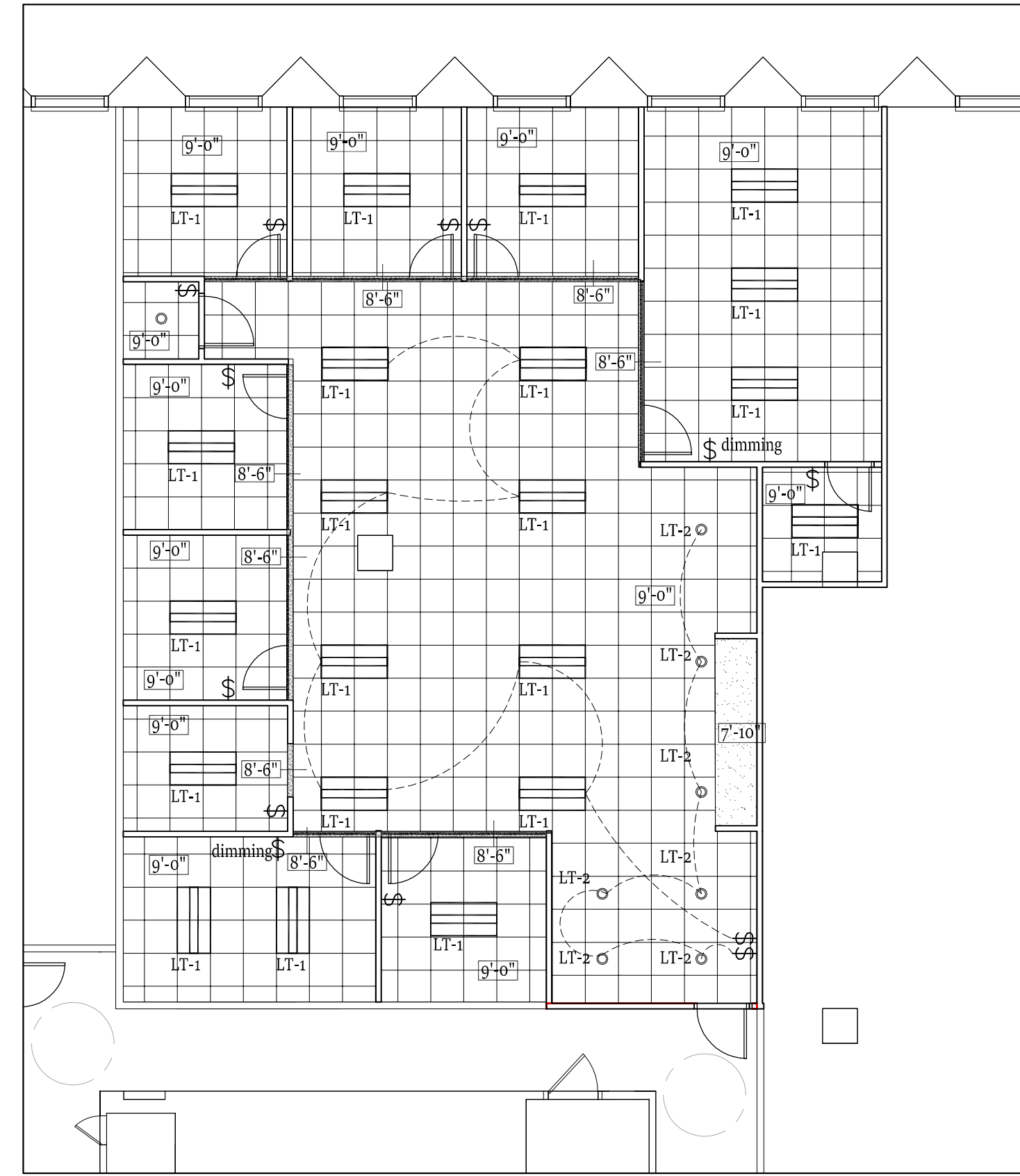
2 REFLECTED CEILING PLAN 1/8" = 1'-0"