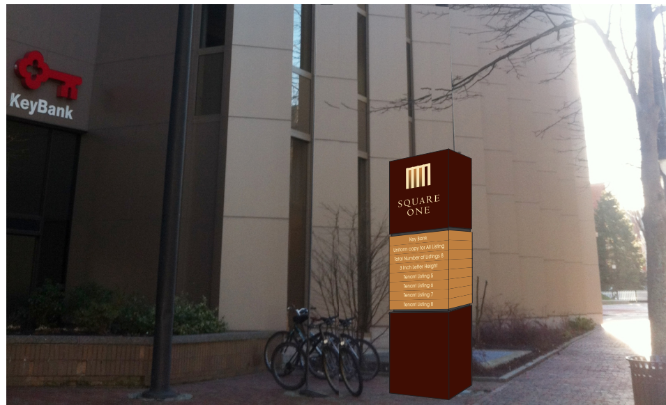
PHOTO PLOT LOOKING WEST ON CONGRESS ST.