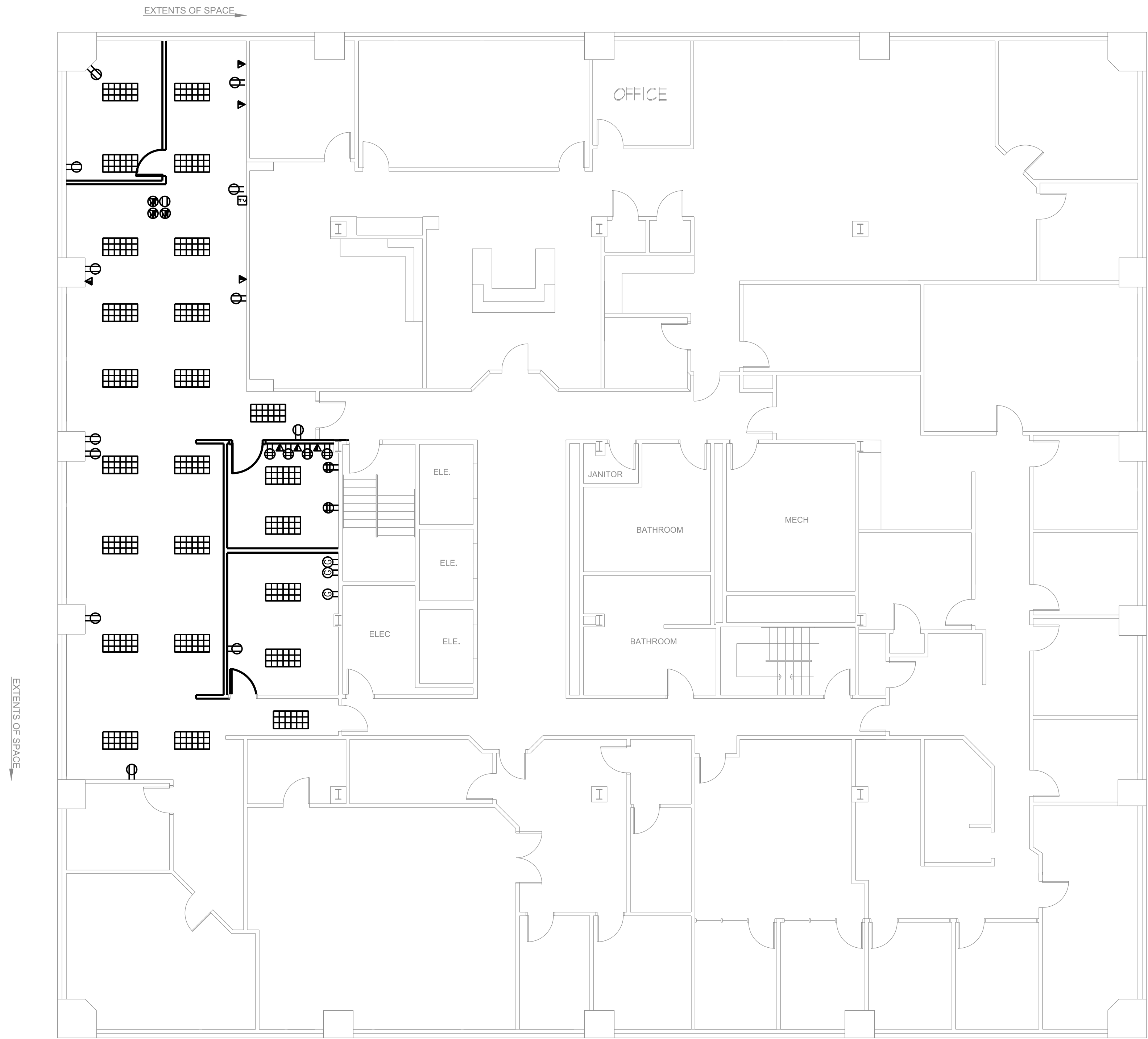
1 | SIXTH FLOOR DEMO PLAN SCALE: 1/8"=1'-0"