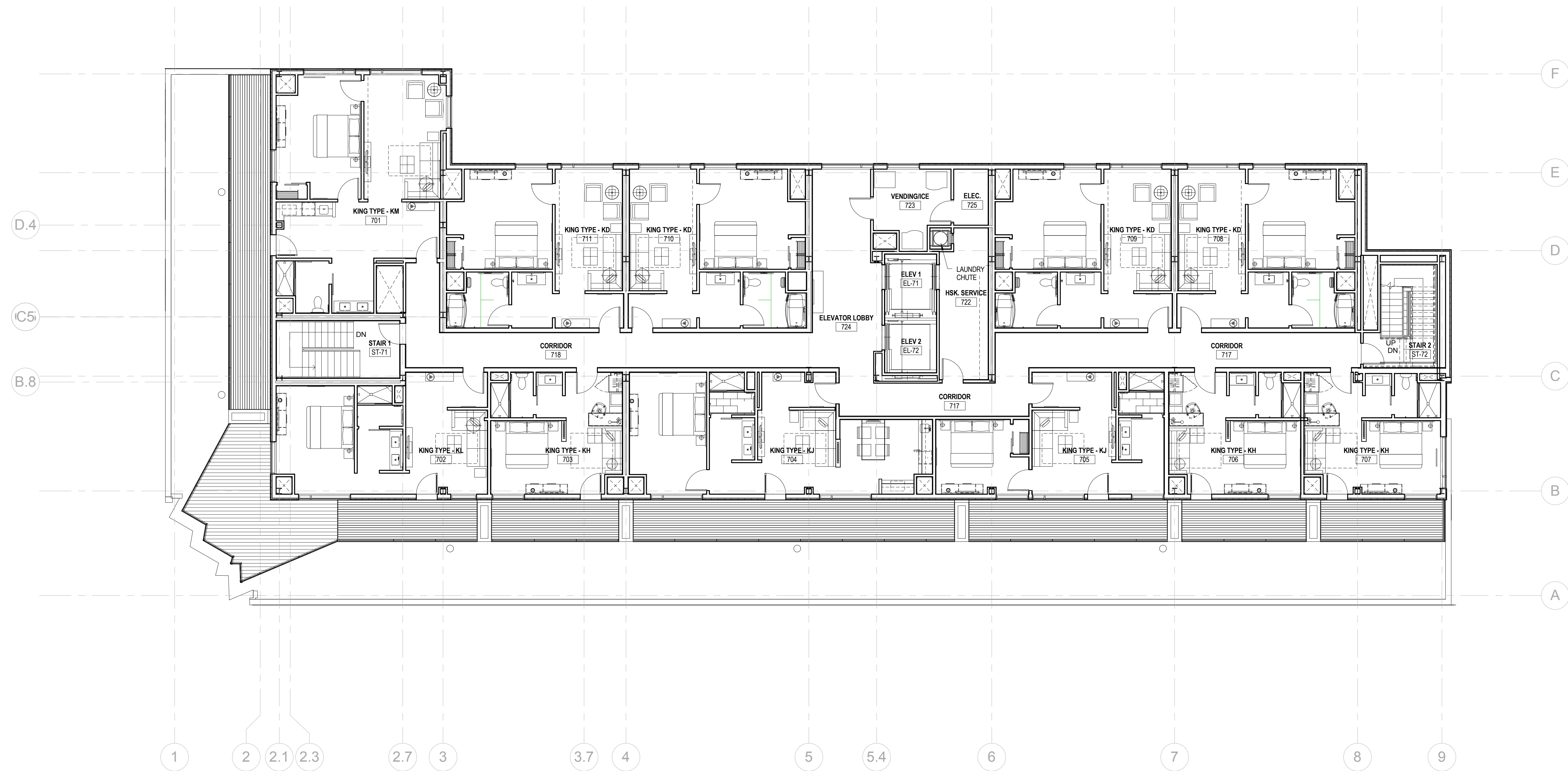
1 FLOOR 7 PLAN 1/8" = 1'-0"