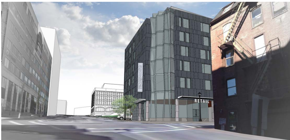
Figures 9 & 10 (top & bottom): Street views from Fore Street looking west; Union Street looking north