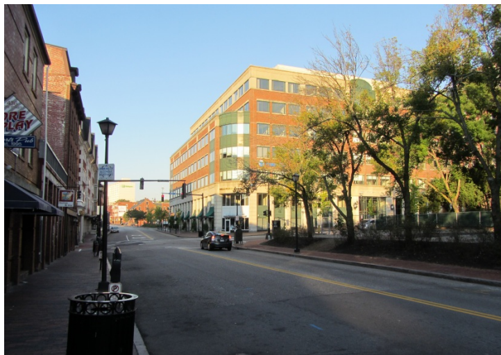
Figures 6, 7, & 8 (from top): Fore Street looking east, including the Historic District, Fore Street Garage, 2 Portland Square