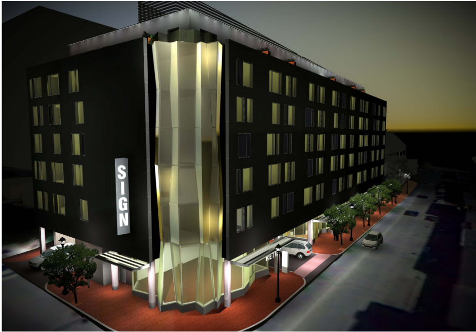
Figure 11: Lighting concept