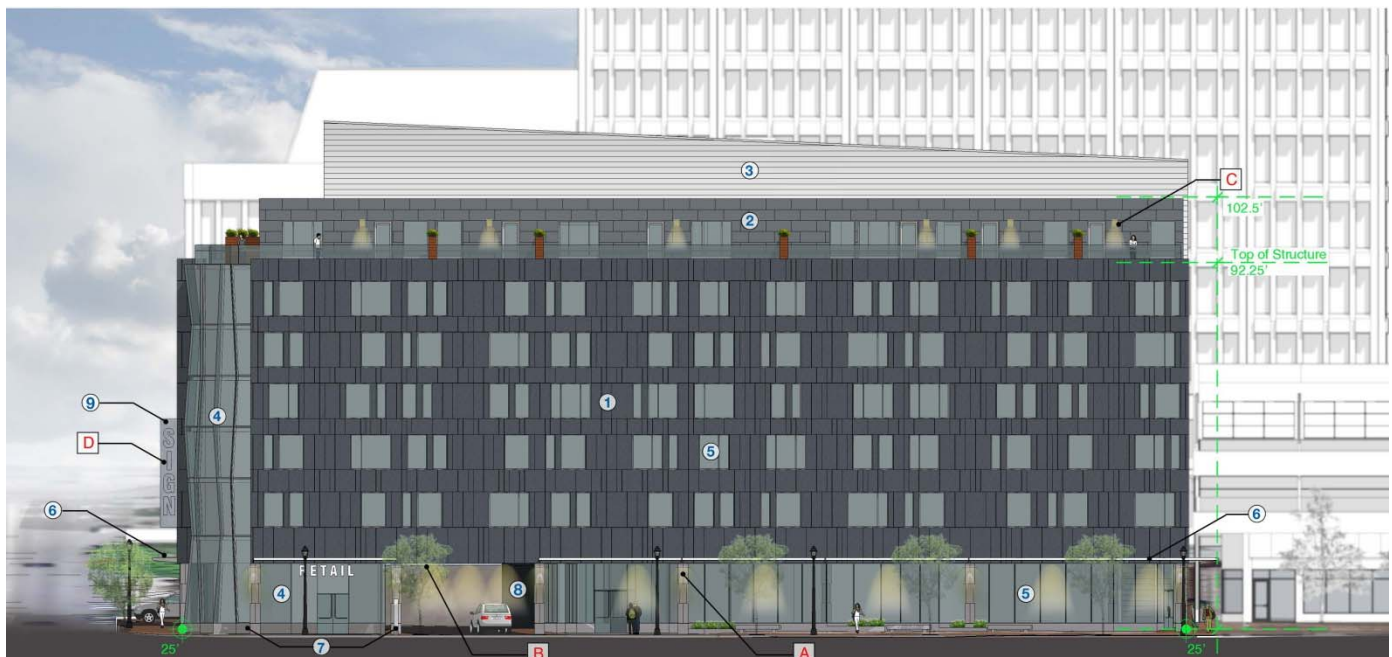
Figure 5: South (Fore Street) elevation

The applicant has requested capacity letters from both the city and the Portland Water District. These will be required as a condition of approval.