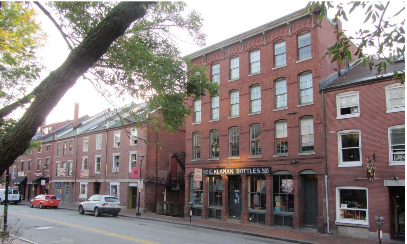
Figures 2 & 3: Canal Plaza Hotel site from the south (top) and adjacent Historic District (bottom)