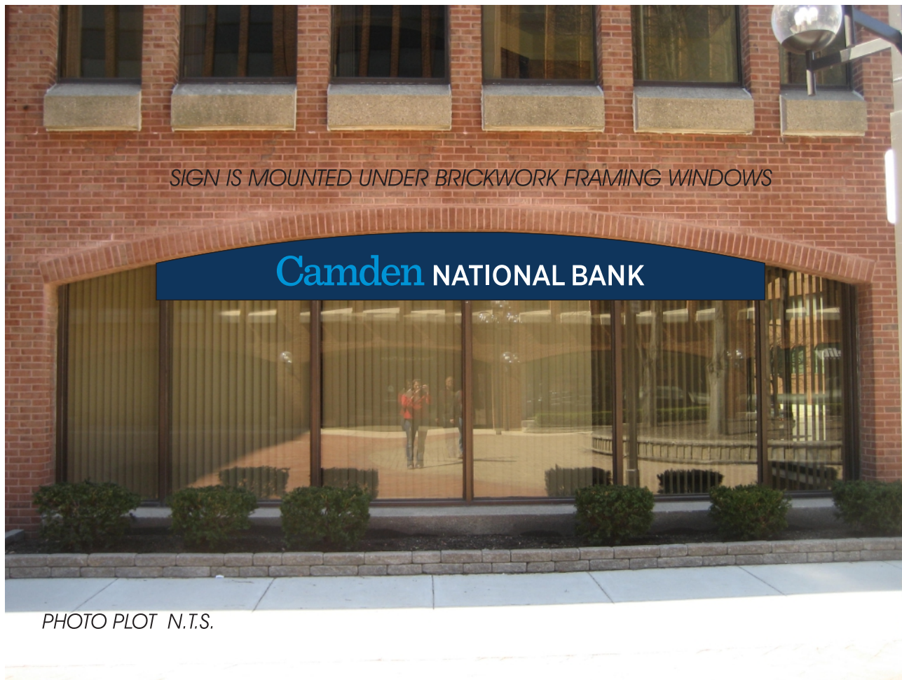
SIGN IS MOUNTED UNDER BRICKWORK FRAMING WINDOWS